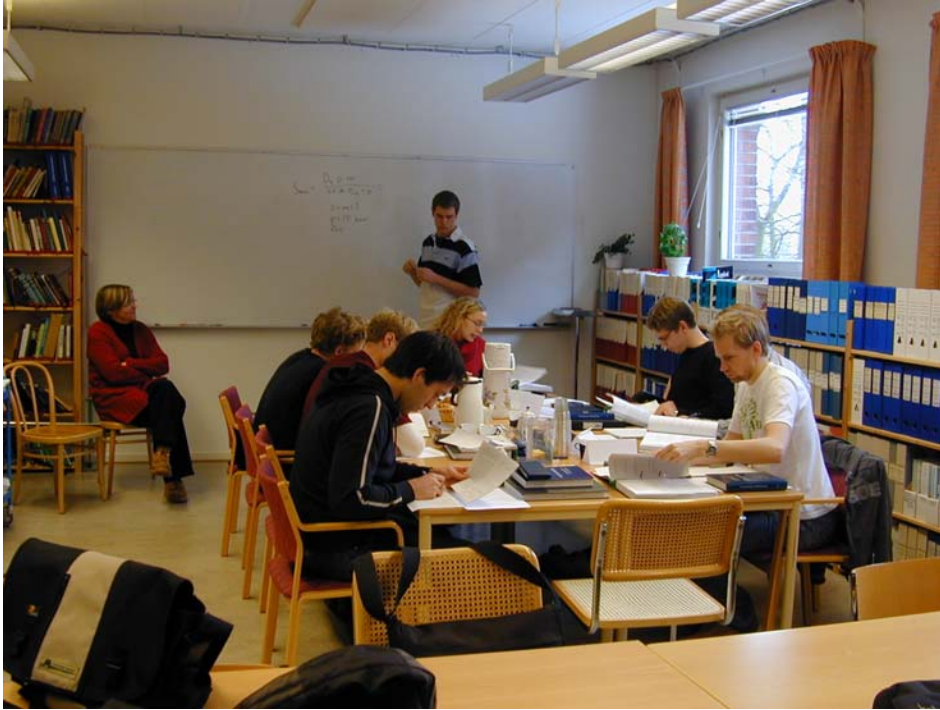
Figure 2. A board in action.

with a decision written by the secretary in a prepared protocol. All the board members are required sign this protocol. Two teachers are present in the room and they take notes on individual student contributions to the process. Up till now, a central criterion for passing this exam is active participation. If the discussion really gets off track, the teachers are allowed to intervene with a short comment to get things back on the road again.