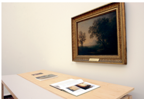
Matts Leiderstam, Grand Tour , Göteborgs Konsthall, 26 nov 2005 – 15 jan 2006