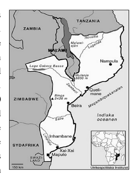
Figure II: Illustrates Mozambique, the country's biggest cities, oceans and countries around it. <sup>2</sup>

The Republic of Mozambique belongs to Africa and is located on the southeastern part of the continent. Mozambique is bounded on the north by Tanzania; on the east by the Mozambique Channel of the Indian Ocean; on the south and southwest by South Africa and Swaziland; and on the west by Zimbabwe, Zambia, and Malawi. Mozambique is estimated to occupy a total area of 801 590 km² between the latitudes 10° 27′ and 26° 52′ S and longitudes 30° 12′ and 40° 51′ E. Mozambique's coastline stretches over 2,500 km along the Indian Ocean from the Republic of South Africa to Tanzania. Mozambique's population is estimated to be 18-19 million people, of whom 52% are female.