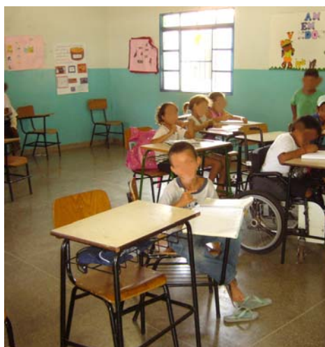
A regular classroom