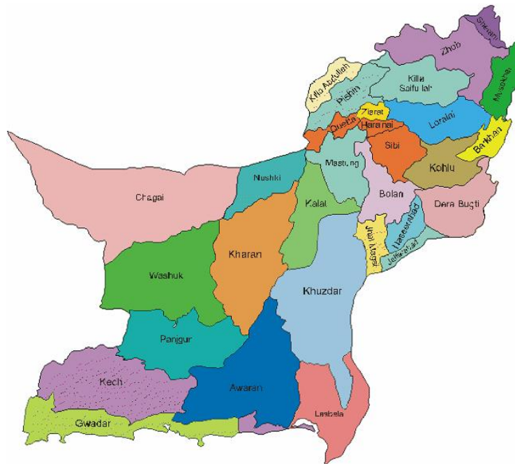
Map 2: Map of Baluchistan

areas lack the culture and facilities for education. Similarly, the rural areas lack most welfare facilities such as healthcare, income generation activities for both men and women etc. Poverty is evident in the rural communities and according to UNDP it is 9% higher than the national average rate (Anon., 2011).