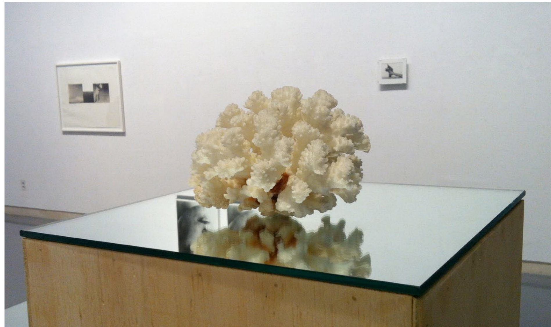
Close-up, Coral object, mirrors.