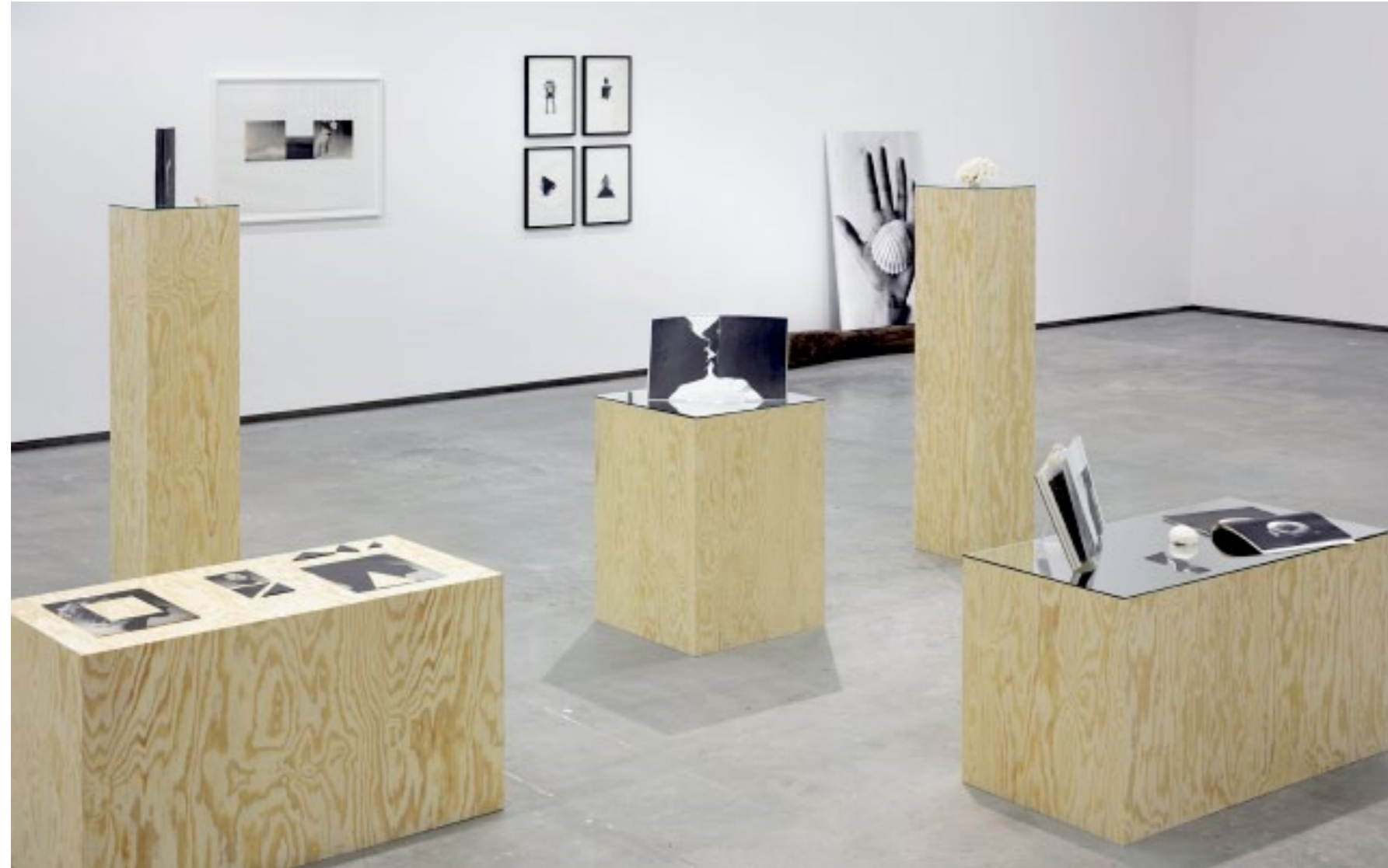
Installation view Arrangements iV-Vi, behind Kobra, Geometry of Love, A millions years