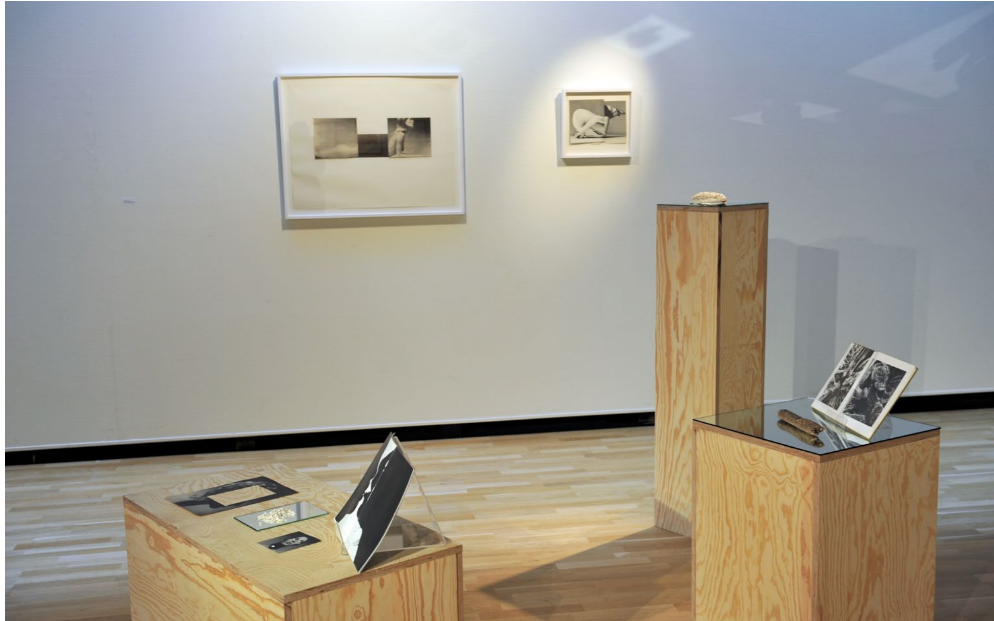
installation view from Black Light,(mirror shells, plinths, magazines ,collages, photography,driftwood Behind on the wall Kobra( 60 x 90 cm) och Cobra( 33x 33 cm)