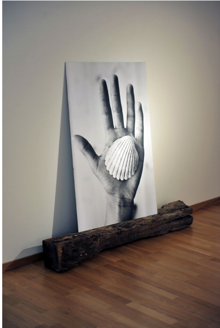
Millions of years , Silvergelatinphotography on dibond 70c 100 cm. Driftwood ca 35 x 105 cm

Documentation from Three photographers, Three tendencies, Marabouparken Stockholm 2012