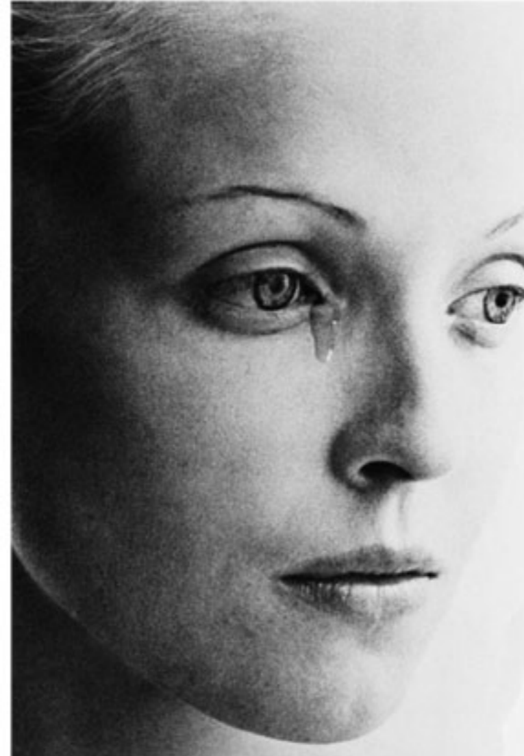
Sans Titre( Hommage á Lautom,, silvergelatin photograpy/ collage

Catalouge, Three Phtographers, Three Tendencies 2012