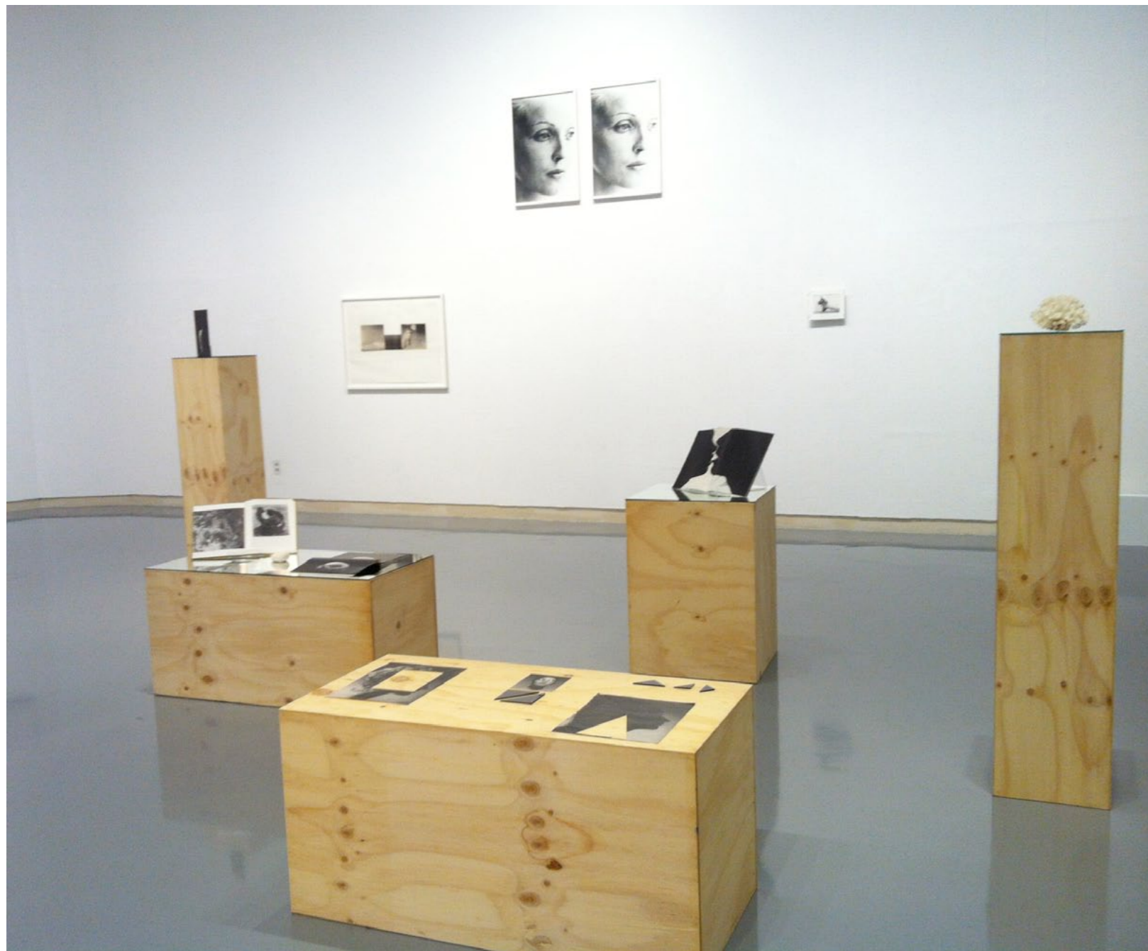
Installation view Arrangements I-V plywood plinths, col- lages, shells corals, printed matter, objects, mirrors,objects,photography