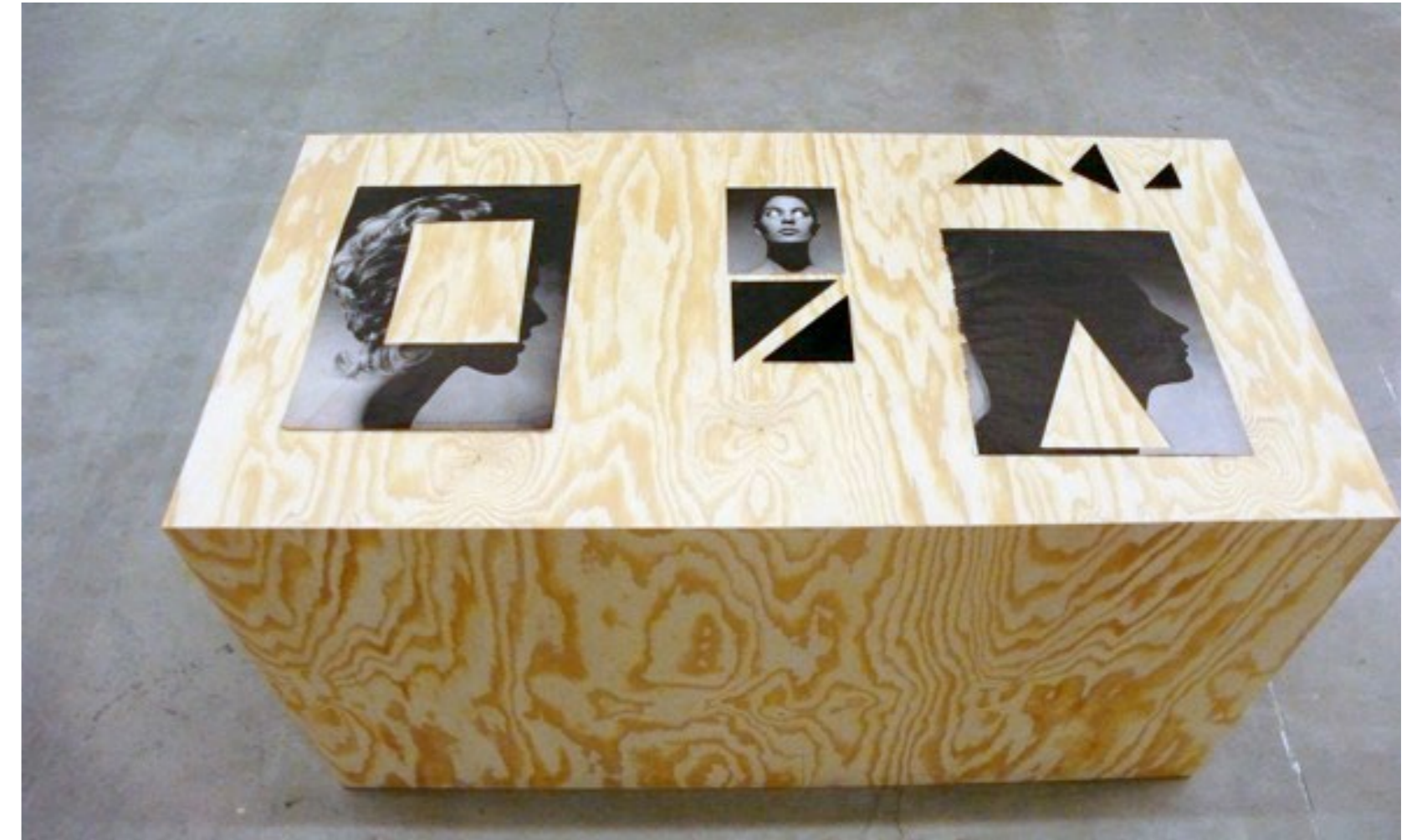
Arrangements iV Faces, ( collages printed matter, plexi geometri shapes, shells)