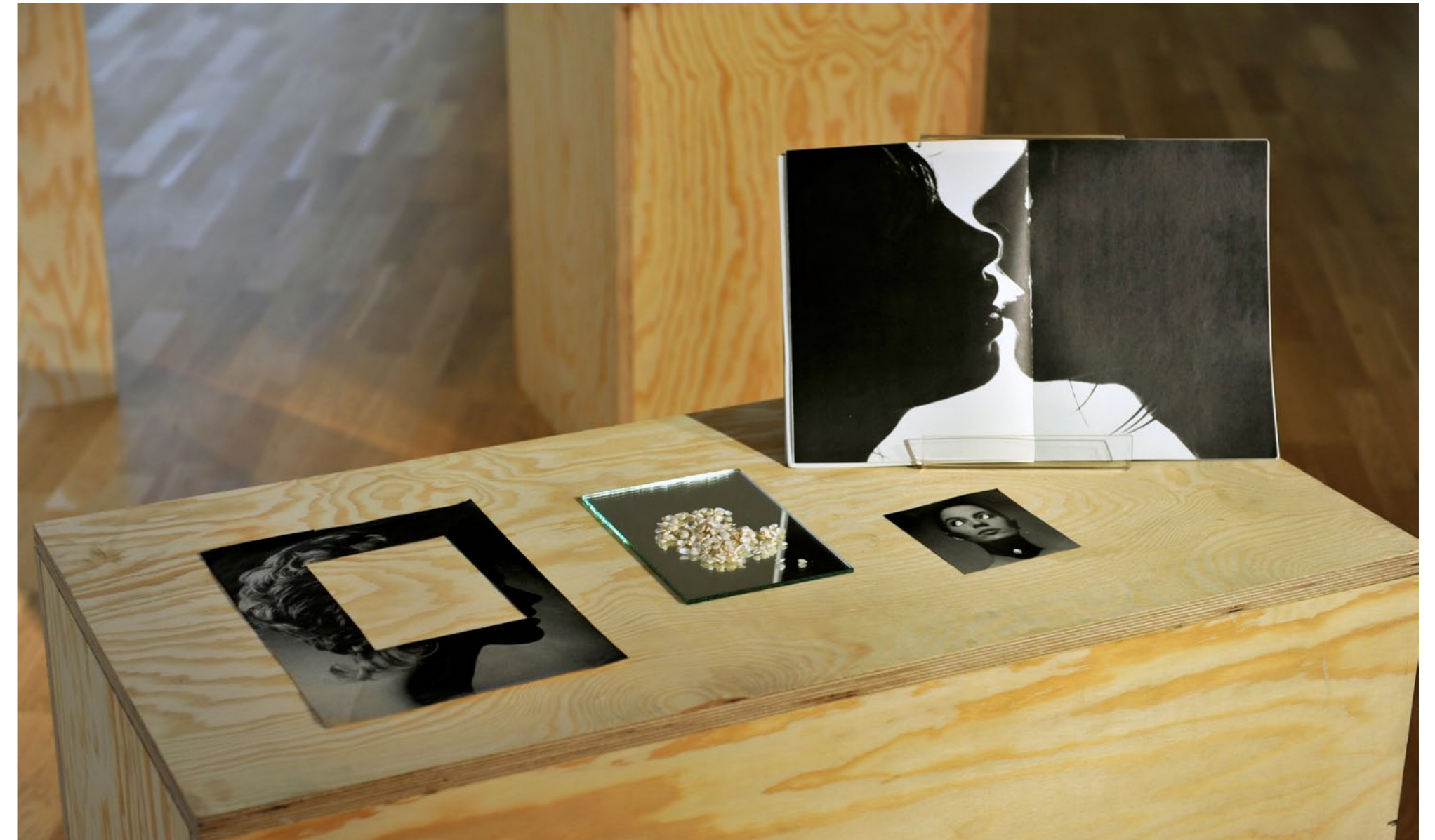
Close up Installation from "Black Light"