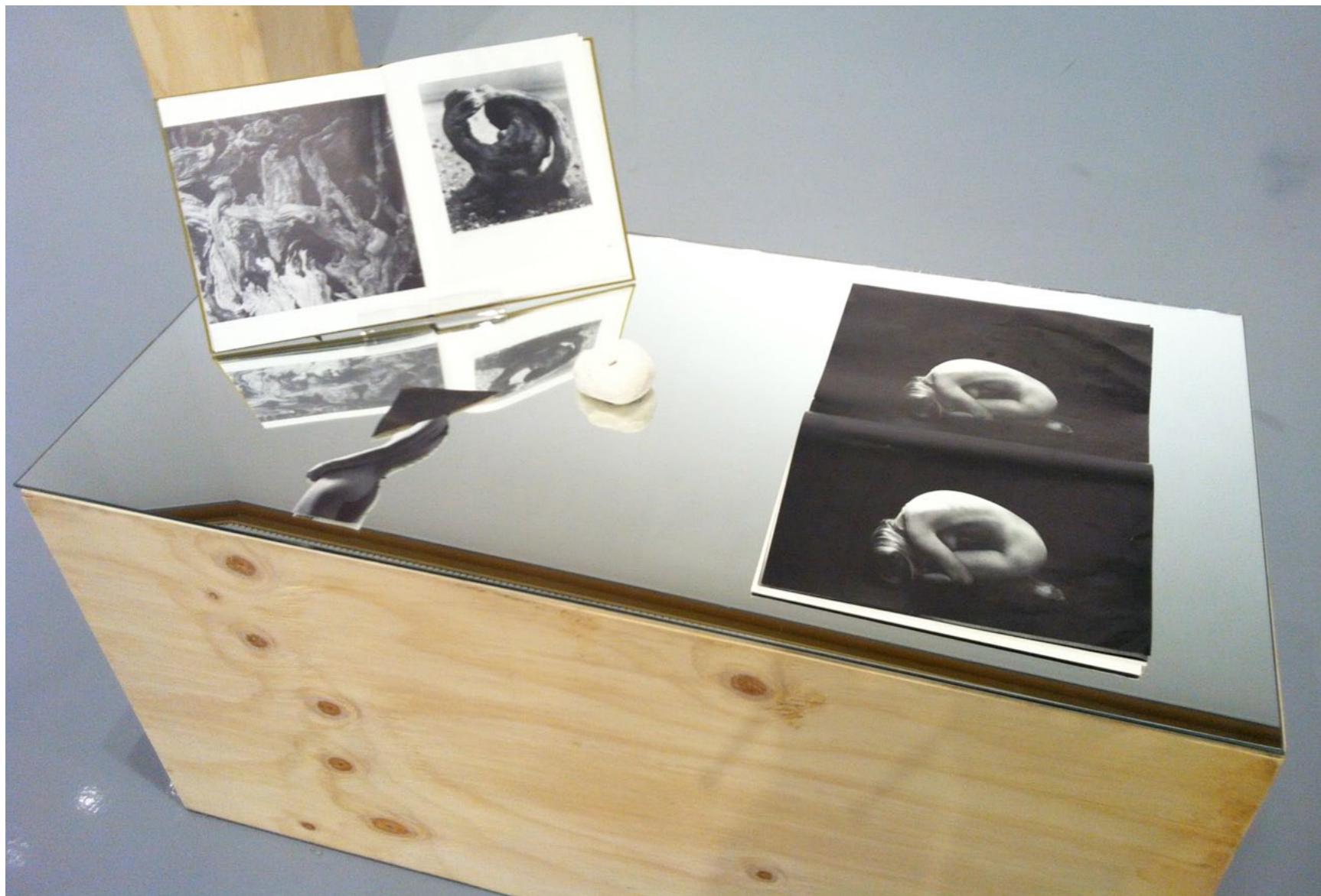
Close up Arrangemnets I-V , printed matter, coral, collage, artist book, mirror.