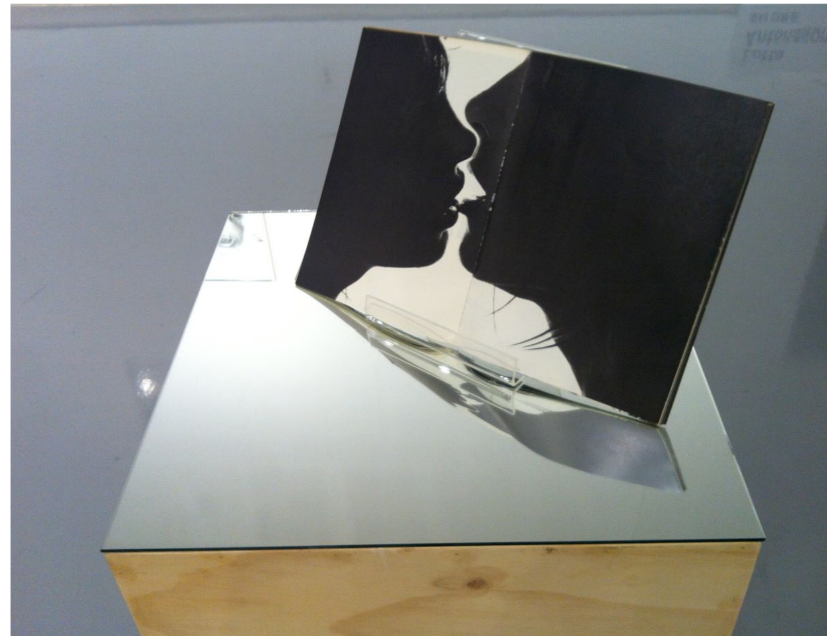
KISS, printed matter on mirror. Part of Installation Arrangements I-V