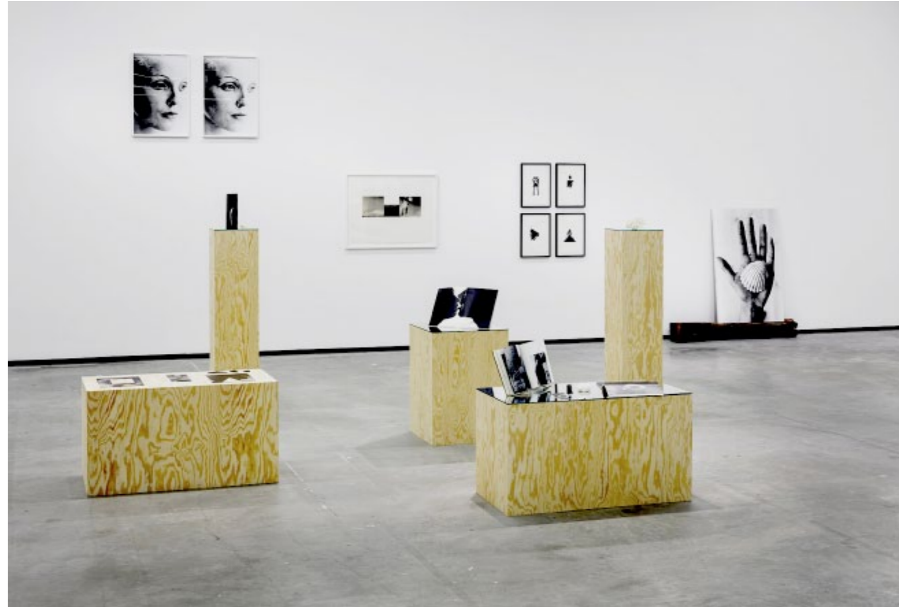
Installation view, Arangements iV - V1