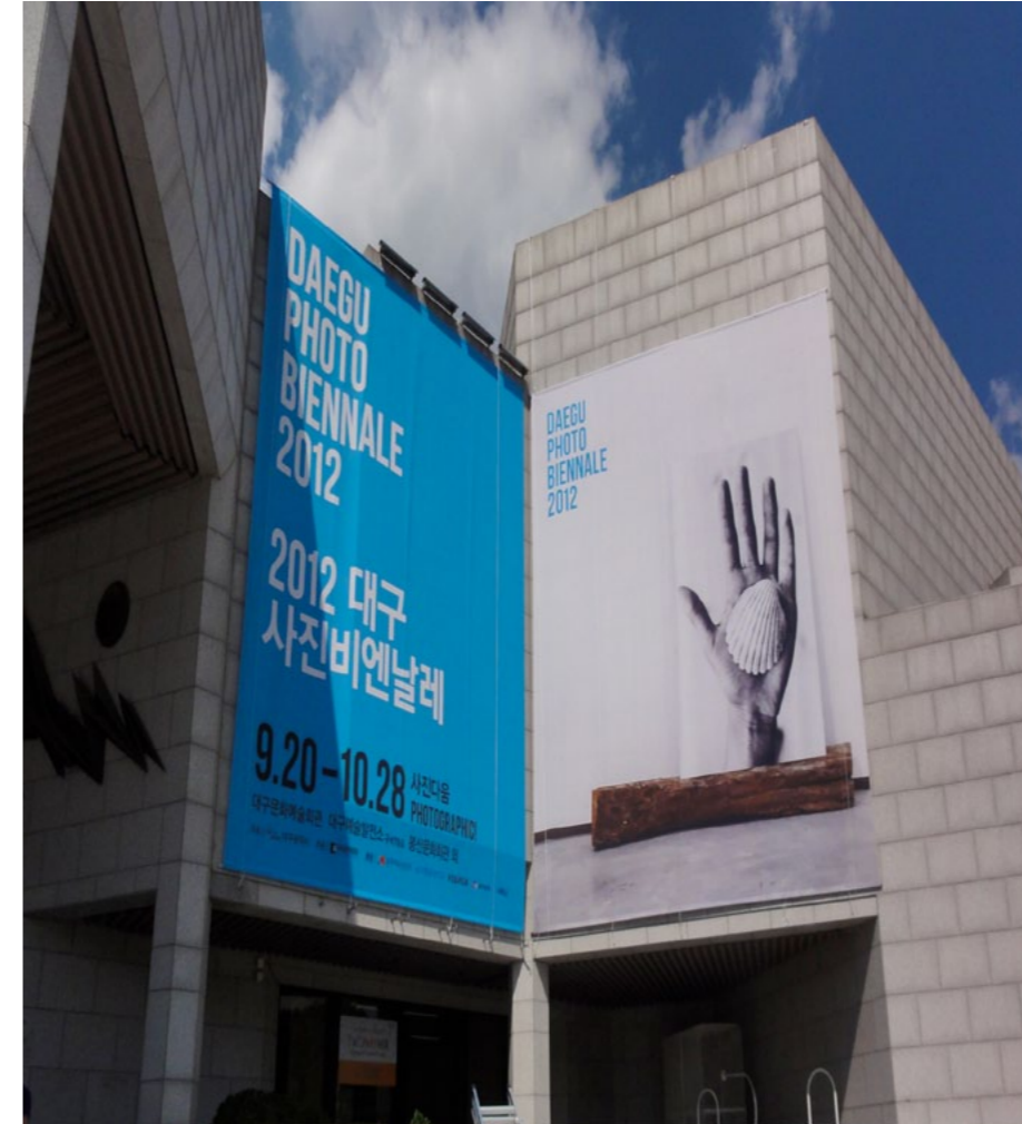
Photography is magic! Daegu Photobiennial Korea,2012 Documentation from Installaton/ Exhibition.