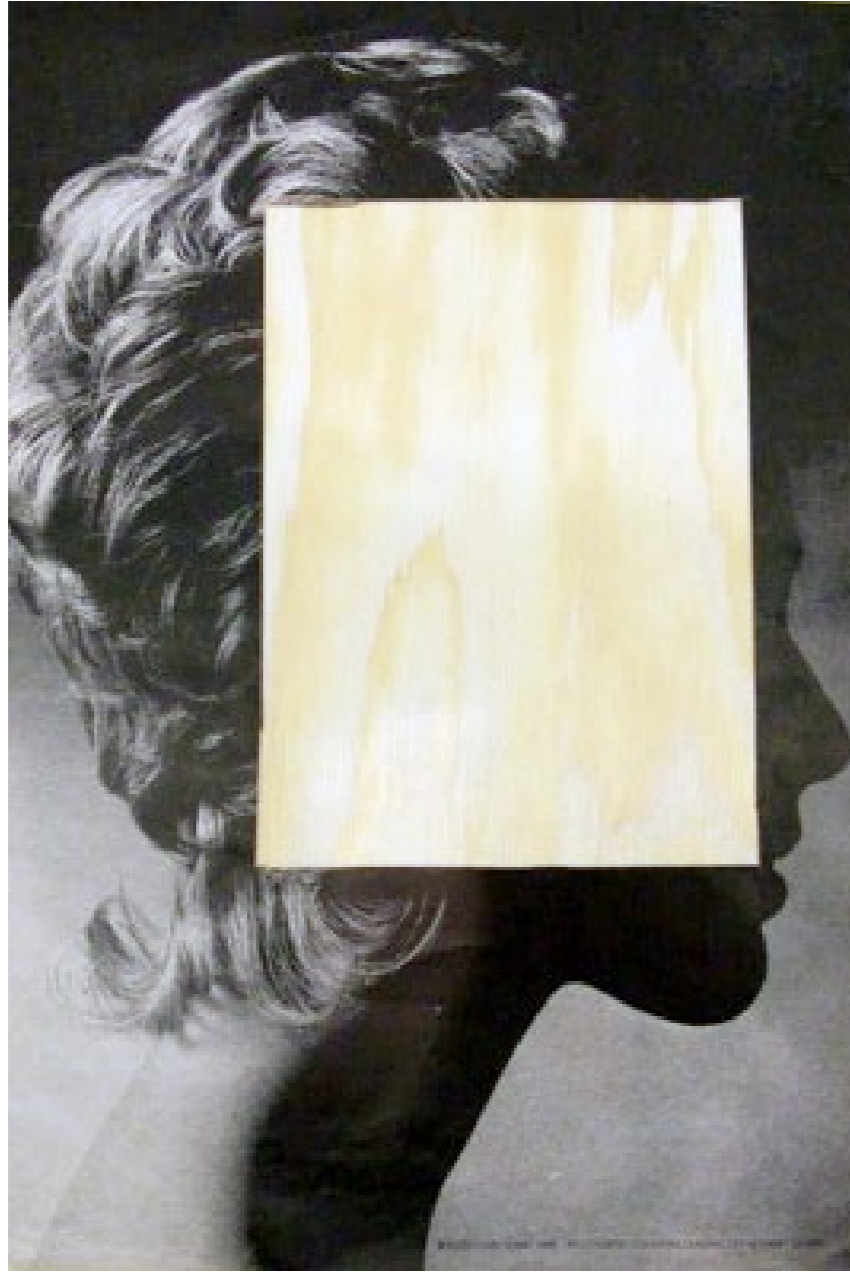
Close-up Collage Face with wood