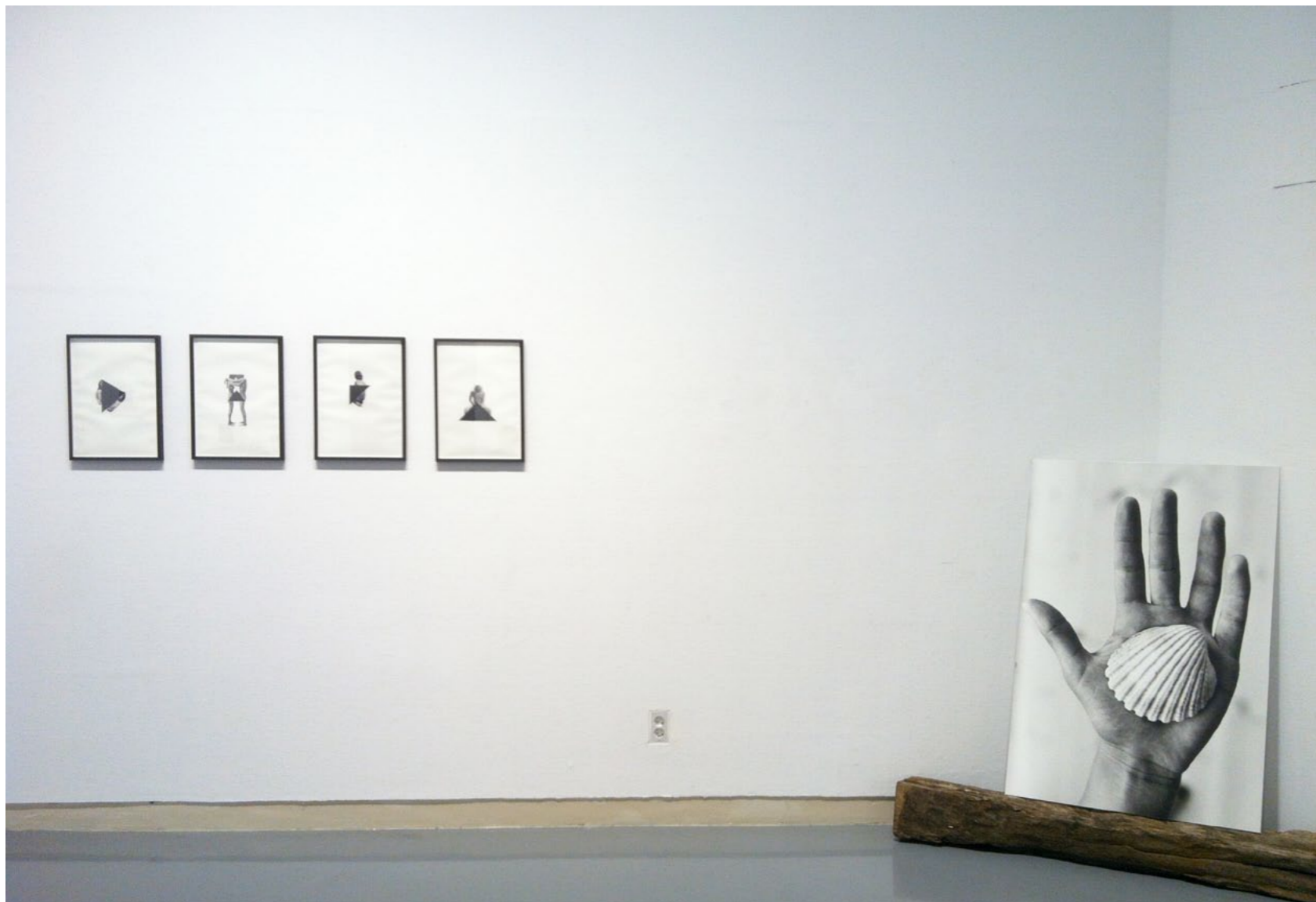
Exhibition view Speaak, Memory ( photography 70 x 100, on driftwood)