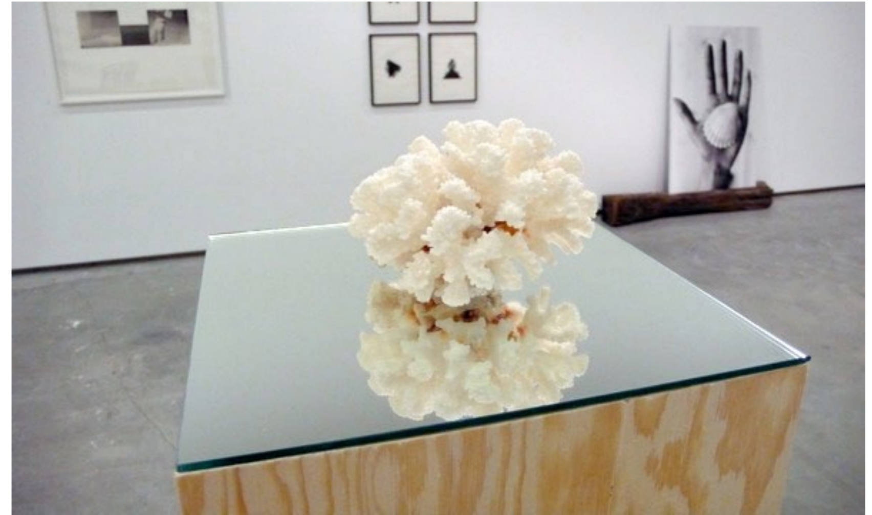
Coral on mirror