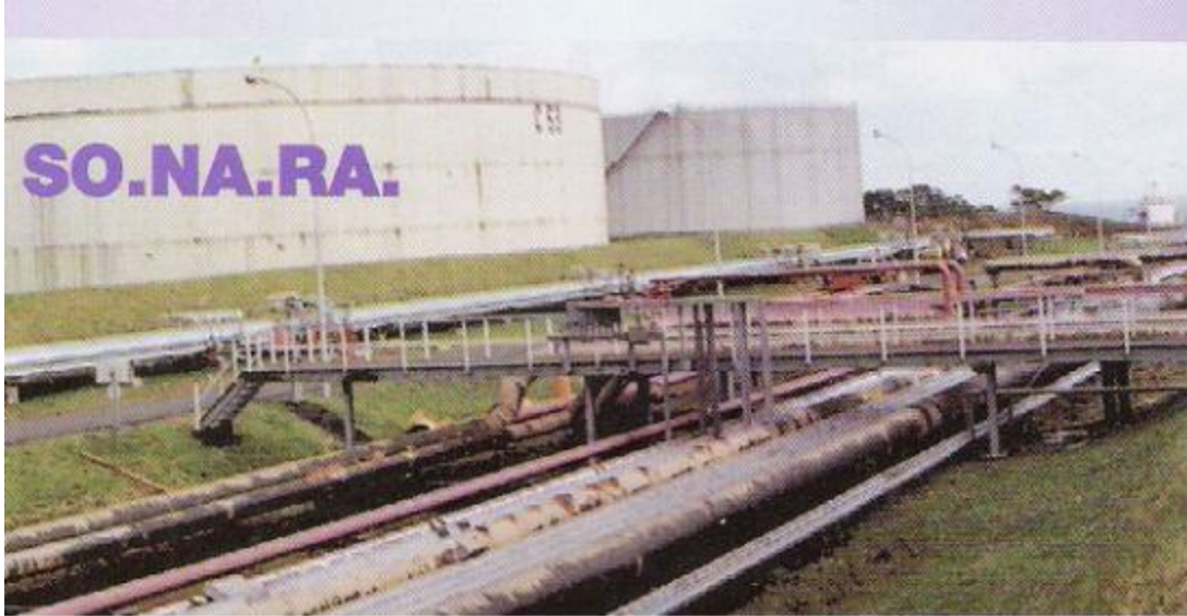
Figure 4. The National oil Refinery Company (SO.NA.RA)

Information for this thesis was collected under the two thematic areas of the research that seek to address the research questions: SO.NA.RA's recruitment strategies and implementation and SO.NA.RA's sensitivity to CSR (with particular attention to employment issues) with the local communities where its operations are carried out. Also to note is the fact that, all the data to be presented here corroborate the research objectives.