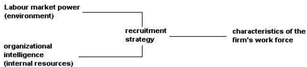
Figure 2, Adapted from Windolf (1986)

Windolf further argues that the second variable that influences the recruitment strategy used by firms is their organizational intelligence. Organizational intelligence is an organization's ability to handle complex labor markets. This means the capacity of firms to use professional knowledge, to gather and process information and to devise complex labor market strategies. Some firms survive only by muddling through while some establish professional departments to control external labor markets and to devise strategies for the utilization of manpower. Windolf points out that the organizational intelligence of firms is not identical to the presence of a personnel department. For example in some German firms, trained work councils use their rights of codetermination to dominate the personnel policy of the firms. Therefore, the recruitment strategy of a firm should be regarded as the result of the bargaining processes instead of unilateral regulation.