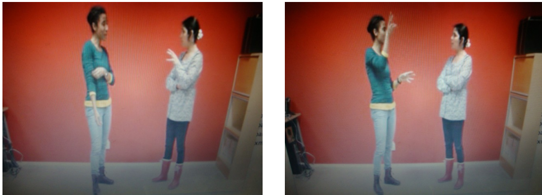
Fig. 1: C2 doing a single-handed gesture and C1 doing a both-handed one.

However, some differences in the gesture production of C1 and C2 occurred also. For instance, while most of C2's hand gestures were single-handed, C1 used both hands in most of her gestures. C2 also did a considerably less amount of peripheral gestures in comparison to C1. When it comes to the repetition of the hand movements, C1 did in both of her interactions 10 single-movement gestures more than repeated ones (approximately 55% of all of her hand gestures when talking to S1 and 58% when talking to C2), while C2 did 4 times more single movement gestures than repeated ones (80% of all of her hand gestures).