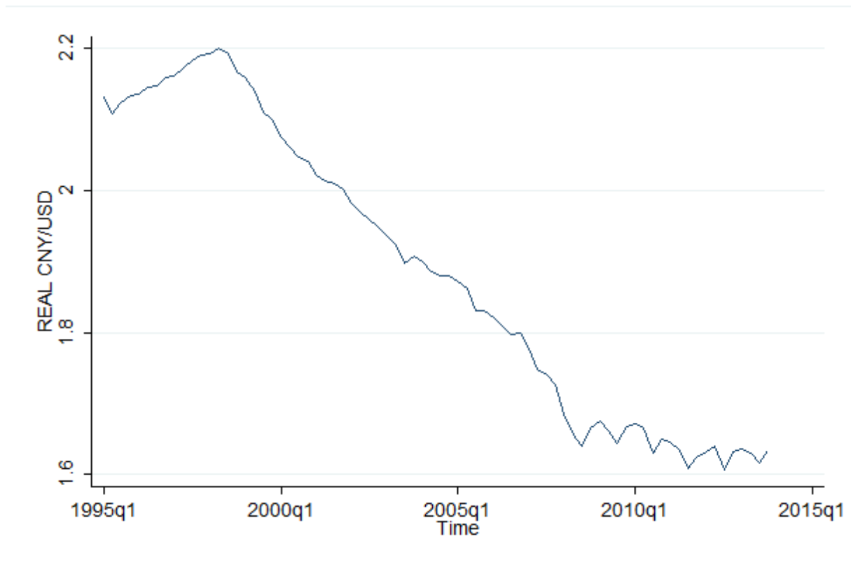
Figure 5.1.2 Differentiated Real CNY/USD exchange rate