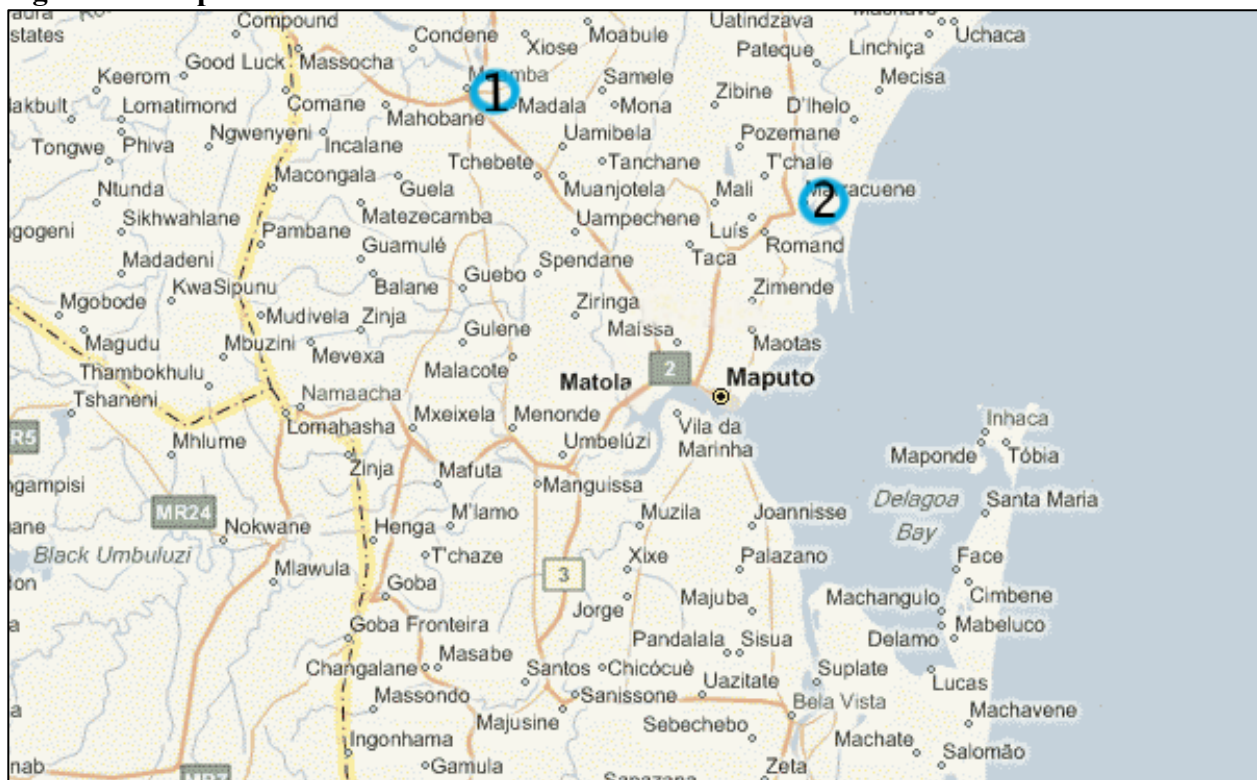
Figure 2 – Maputo Province

The field study was carried out in the Maputo Province in Moçambique, we interviewed 12 women in three villages in rural areas. The selection of these villages was based on information from Electricidade de Moçambique (EDM), the Maputo main office and local district offices, as well as the local government in the district where the villages are located. The first two villages, Mbanhene and Madinguine (area 1 in Figure 2), are located within the Moamba district jurisdiction, and the third, Faftine (area 2) is within the city of Marracuene's jurisdiction.