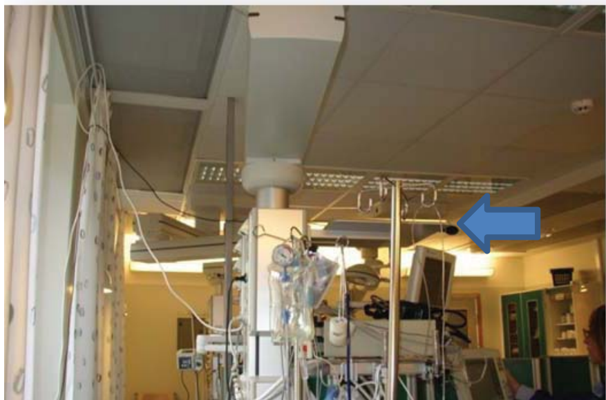
Figure 3. An ICU patient room. The arrow shows the placement of the sound recording devices (Study I).