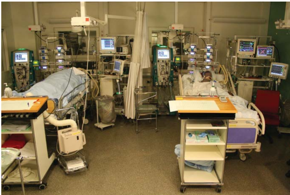
Figure 2. Picture from a two-bed ICU patient room in a Swedish hospital opened 1996.