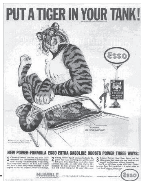
Figure 1. "Put a Tiger in Your Tank!"

Although the meaning of the advertisement is fairly obvious, the rhetorical logic is more complex. The figurative meaning of the tiger is primarily metaphorical, representing strength and power. In contrast to the metaphorical expression "Achilles is a lion", where the analogy with the lion implies not only power but also courage and aggressiveness, the Esso tiger is a smiling and friendly character, tuning down or even negating the aggressive aspect of the metaphor. In the image above, the Esso tiger is furthermore anthropomorphized to the extent that its left front leg has the form of a human arm with bulging biceps. However, the connection between the friendly tiger and the product (petrol) is not metaphorical but metaleptic (or metonymic): the effect of putting Esso petrol in "your tank" is that it will make your engine more powerful and that your car will behave like a tiger (albeit a friendly and not fearful one). The tiger represents the metaphorical future effect of putting Esso petrol in your tank. In other words, in the advertisement the tiger constitutes a visual metalepsis.