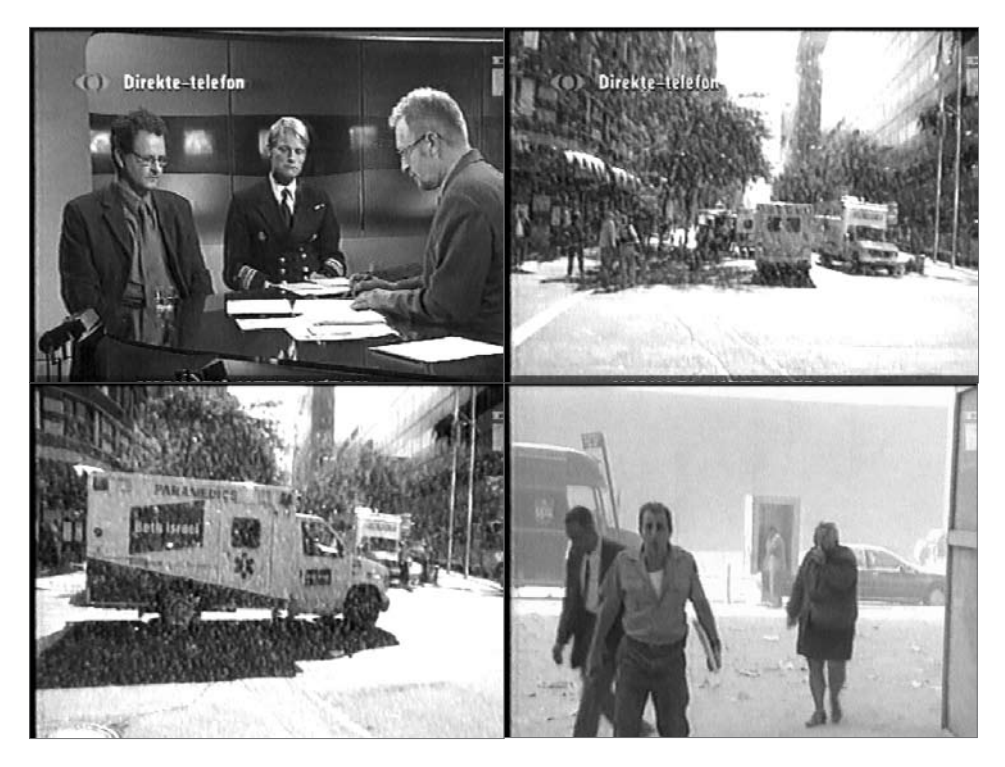
The update of the 'morning of September 11<sup>th</sup>' events was inserted into the flow of the footage at regular intervals during the rolling footage. The management of visibility takes us everywhere where action took place: New York with the WTC attacks; Washington DC with Pentagon burning; Georgia with Bush' first appeal to the American people. The manner in which these sequences are linked, particularly using Bush's speech to

I concentrate on three distinct sequences from the September 11<sup>th</sup> footage on Danish television: the eye-witness account, the update of events and the panorama of the Manhattan cityscape. The eye-witness account is a right here-right now exposition of events. We are together with the expert panel at the Copenhagen studio and, at the same time, connected via telephone link with the Danish Consul in New York. Satellite images show ambulances and people walking away from the scene of catastrophe, whereas the Consul gives a first-person account of chaos and mayhem in Manhattan. The aesthetics of this sequence is that of raw documentary. Camera and human voice combine in a complex act of witnessing that invites Danish spectators to experience the events as-if they were there on location and to share the intensity of emotion as-if they were themselves present in the scene of disaster. As a consequence of this intense proximity, moral agency is cast in the topic of empathy, inviting us to engage in real-time with the tragic fate of American people and to feel for their unexpected vulnerability.