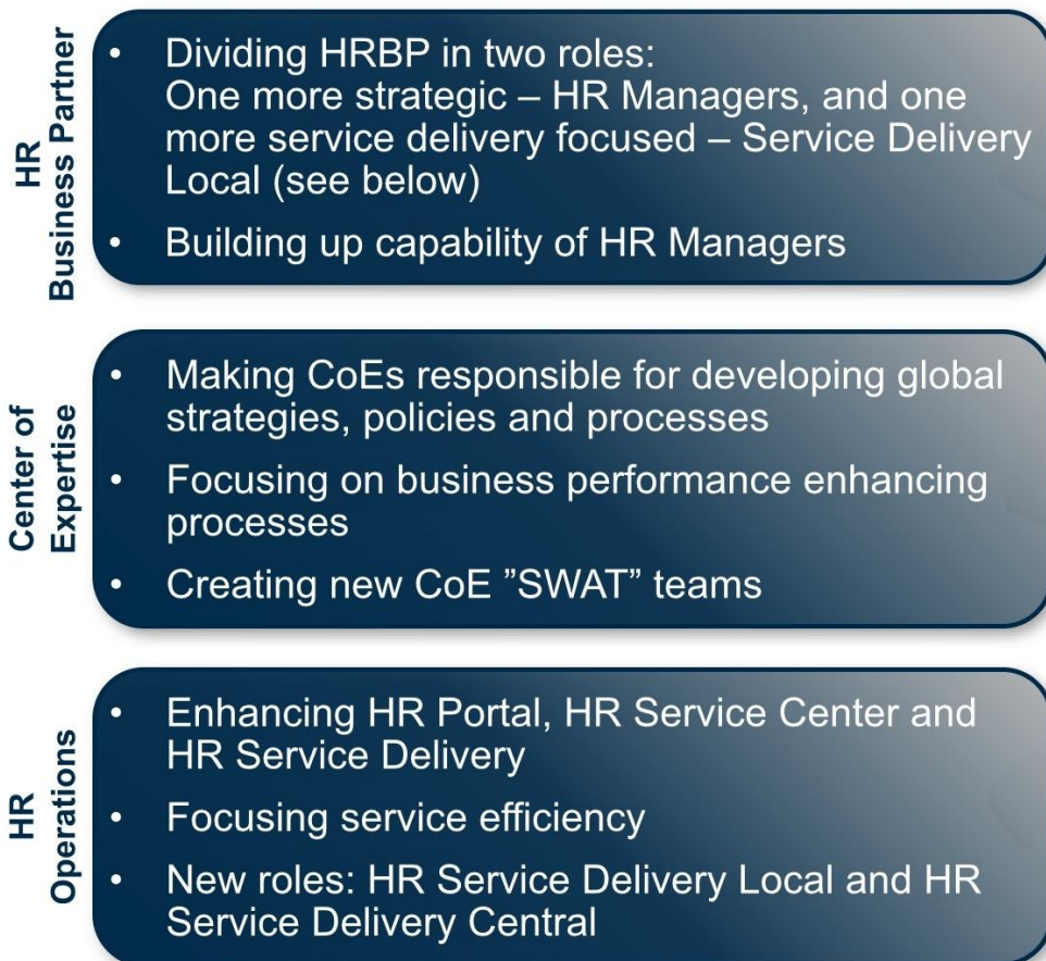
Diagram 2: The changes at Volvo cars (Tengelin, 2013)