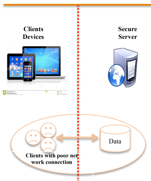
Figure 2: local Connection between clients with poor network connection and sensitive database.

Developers address these issues by “ centralizing sensitive data on the secure server and providing local access between this server and the stakeholders with poor Internet connections, as shown in Figure 2 ”. In addition, “ Developers have employed HTML5 to resolve issues with regard to smart phone OS variants and updates. User interfaces in HTML5 can be easily adapted on different smart phone devices ”.