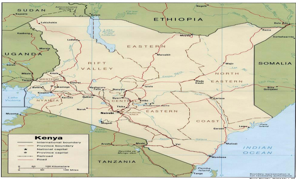
Figure 1: Map of Kenya, 2012

Returning now to the economy, Kenya has, at least, in the last one decade, enjoyed considerable economic growth. Many factors contributed to this: favorable international environment, national support to local and international investment, prolonged political stability, and sustained expansion of a local economic and a professional elite that has invested its wealth in Kenya (Oparanya, 2012). The country has also benefited from continuous efforts to diversify its economic base. From a coffee and tea-reliant economy, Kenya has grown its earnings from tourism, flower exports, and mineral resources etc. Economic growth has however not sustainably addressed social inequalities. Growth has merely benefited a small group of local businessmen from a few ethnic groups, barely trickling down to the poor. Corruption, insecurity, crime, joblessness, high cost of living, marginalization, and poor health evidenced by high incidence of communicable and non-communicable diseases, ethnic strife and crises have also continued to plague the so-called economic giant of East Africa. Currently, an estimated fifty percent of Kenyans live below the poverty line (Oparanya, 2012). I undertook the current research in the context of growing poverty and rising economic marginalization, particularly among men in Nairobi, Kenya.