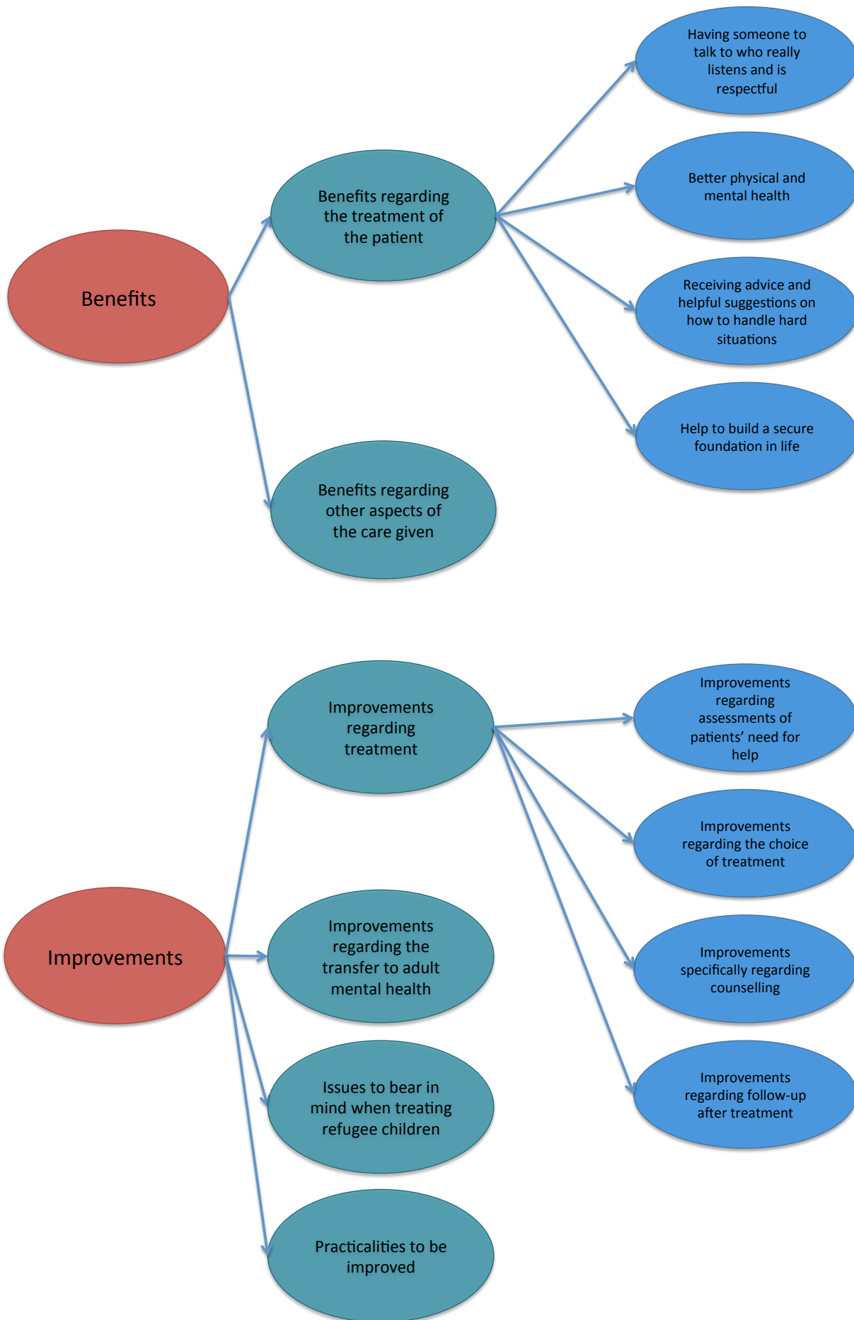
Figure 3. Overview of main themes and subthemes.