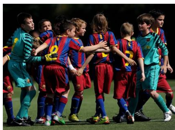
Barcelona's academy trains players as young as six

One of these exceptions (Article 19:2a) states that the transfer of a minor is acceptable if one or more of the player's parents move to the destination country for reasons "not linked to football".