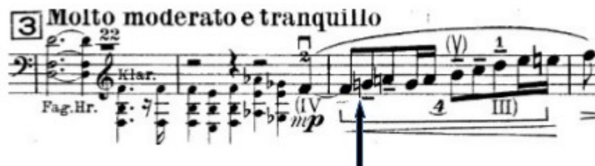
Fig., 6: J. Sibelius violin concerto, op. 47, 1 st movement, bars 91-93.

Just as a curiosity, in fig., 6 I have tried to show how “complex in its simplicity” the legato inside a slur can be.