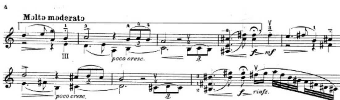
Fig., 4: Violin concerto by J. Sibelius, Op. 47, first movement, second cadenza. Bars 231- 238.

Learning to listen to myself not only comprises the intonation from a technical point of view of violin playing. Legato playing is a basic task which allows string players to sing a melody as a continuous line, regardless if two or more bows are needed to cover the whole length of the phrase. The example in fig. 4 has been taken from the second cadenza in the Violin Concerto by J. Sibelius. 49