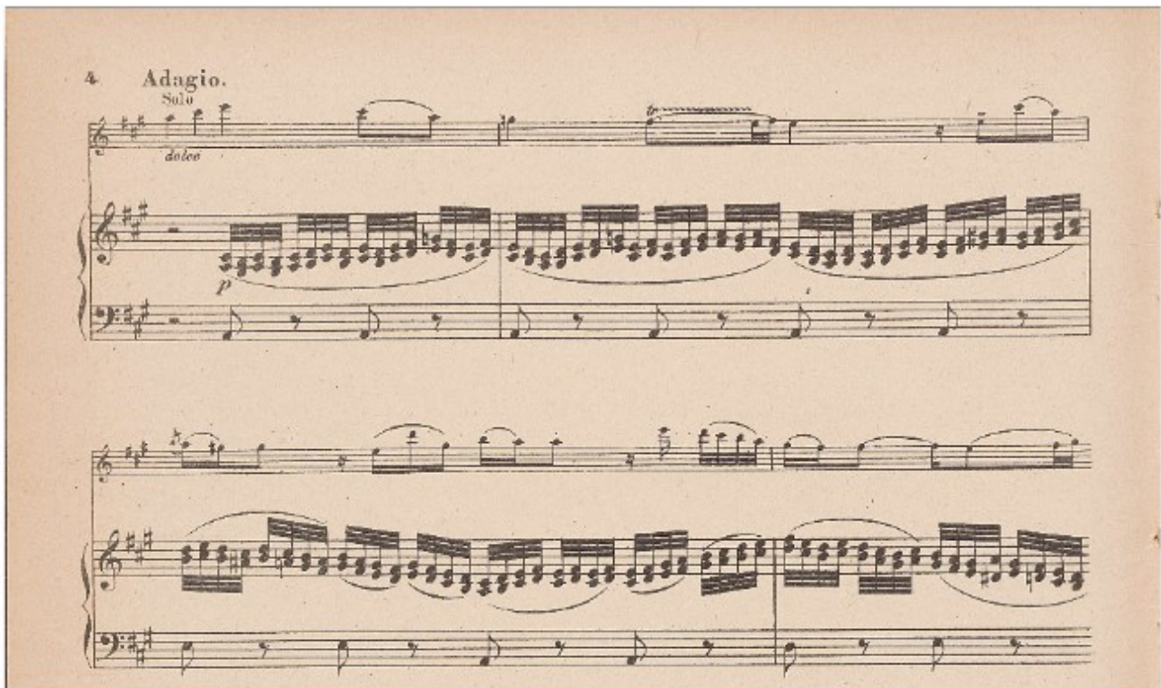
28Fig., 1 Violin Concerto n.5, KV 219, by W. A. Mozart. First movement, bars 40-43 35

The melody in the first three bars is based on an A 7 chord for bars 40 and 41 (with a D Major chord on the second beat of bar 41), and E 7 in the first half of bar 42. Regarding the piano accompaniment, it would be customary to tune every note of the melody with the piano. But tuning with the piano goes against the physic-harmonic phenomenon which, in these cases where the melody is constructed by using arpeggios, give a different colour to the melody. It also goes against the natural physics that governs the instrument. When a violin player plays the first note (A), the violin is also resonating the E (third overtone) and the next C# (fifth overtone), which is already different to the one played in the piano part. The same applies to the G, which is the seventh, and is different in the physic-harmonic phenomenon as in the piano. But going even further, because it is one more question I often wonder, the same fact affects the piano itself. By pushing the right pedal and playing an octave in the low register, it is possible to listen to this phenomenon clearly. Is it in the piano that C# (in case the generated sound was A as in my example before) the same as the sounding one by simply pressing the C# key? To sum up, it seems that, if I practise the adagio