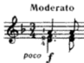
Fig., 3: J. S. Bach, Ciaccona from Partita 2 in D minor BWV 1004, bar 1 48

To close the chapter on intonation, I complete the information with two examples, the first one of them in video format. This is a problem I have found many times in string quartet playing, but I apply it with solo violin in the video: all kind of chords containing C, G, D, A or E can present a problem depending on the key, specially C and G, since they are the last strings on the cello and viola (C) and violins (G). D, A and E strings can be fixed by using an alternative position or fingering if the chord allows one to do that, except when double stops requires the playing of one of them on the open string. It is shown in the video example 47 and here follows an explanation on why, sometimes, harmony might be put in second position for practical reasons.