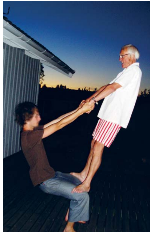
Caregiving at its best; Mutual trust, love, balance and support in empowering surroundings. (Grandchild and dementia affected grandfather. Author's private photo, 2008)