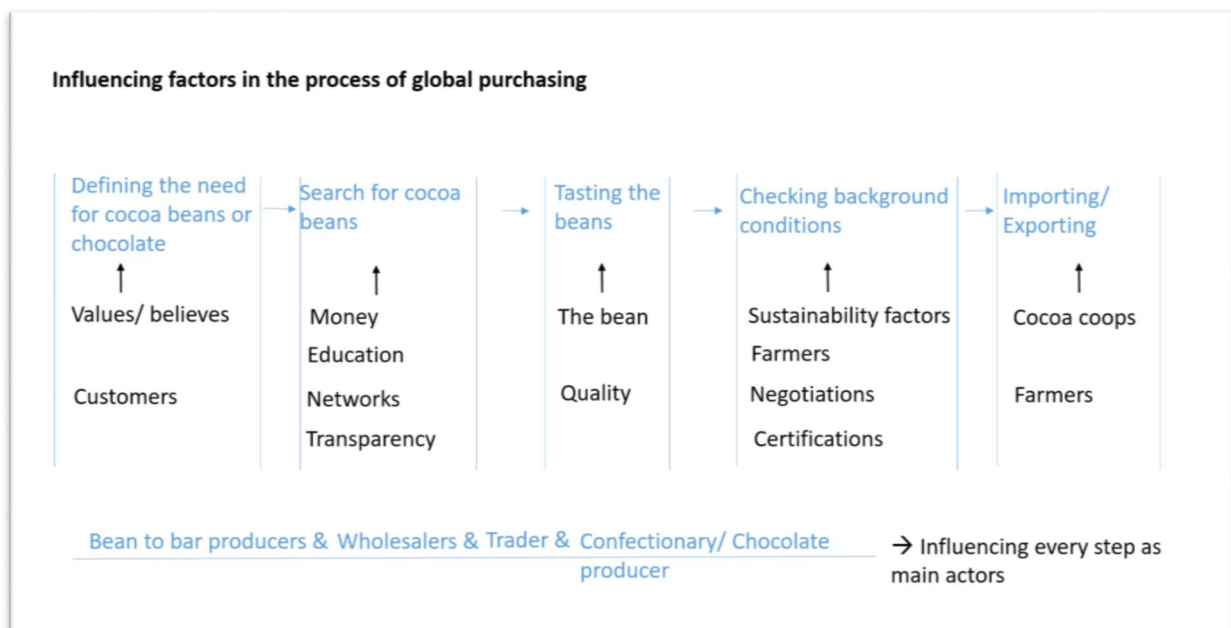
Figure 3: Influencing factors in the process of global purchasing

Figure 3 illustrates though what factors the method transforms in each step of the global purchasing model and since the influences are heterogeneous it provides an understanding of why such changes are transforming differently in SMEs.