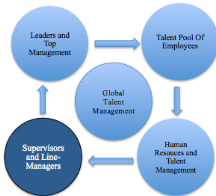
Figure 1. A Multiple-Actors Model .