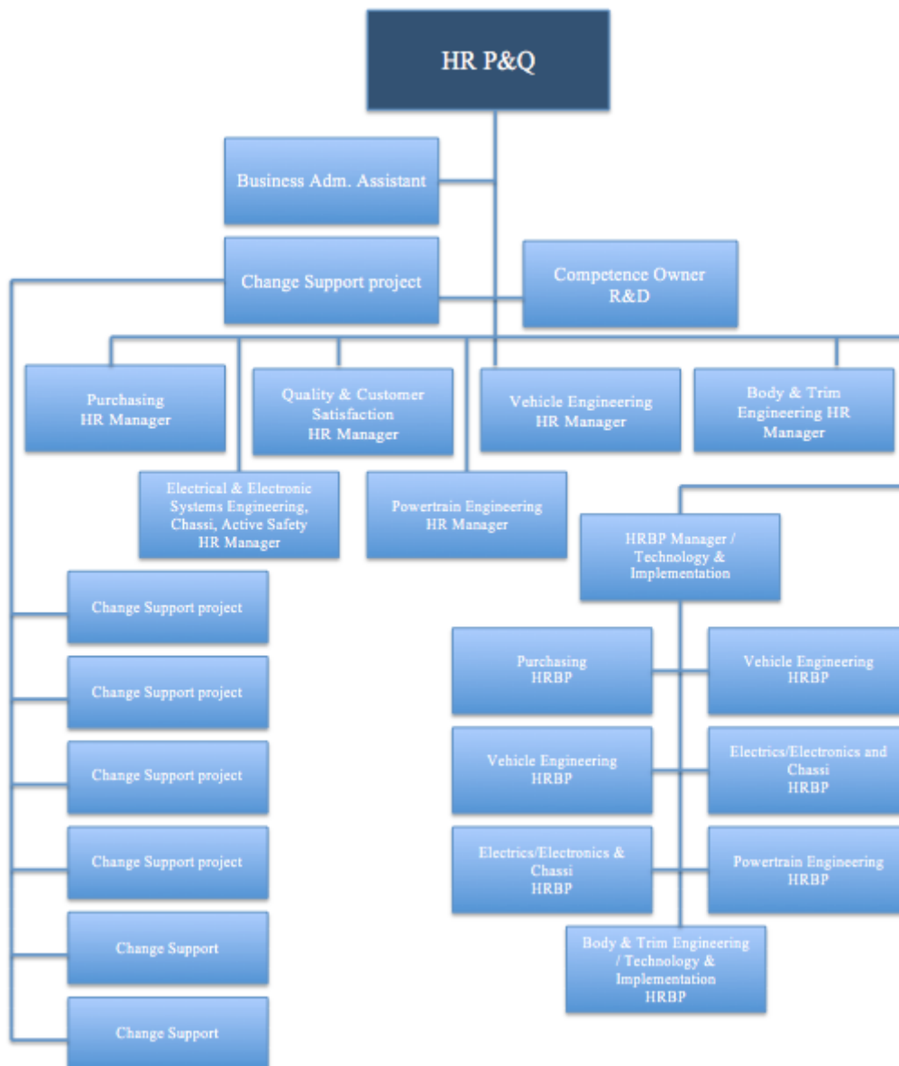
Figure 4. Organizational Hierarchy of the HR Product & Quality department