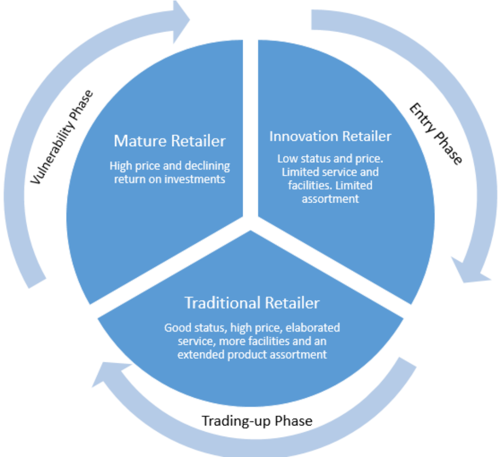
Figure 2: “The Wheel of Retailing”. Our compilation. Based on the figure made by Zentes et al. (2017), p. 28.

get by following the process in the Uppsala model from 1977. We suggest that, as the company advances in the wheel of retailing, it does several laps in the Uppsala model. When the accumulated market knowledge of what the customer actually wants, has reached a level where adaption can be implemented in order to attract the customer, the step to the trading-up face becomes a fact.