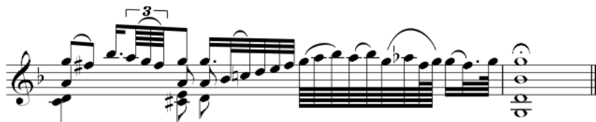
Figure 5 My transcription of Heifetz's realisation of Adagio's final two bars

Heifetz's changes to Bach's original bowing here make the final phrase sound laboured to me; where there should have been one long 'wave' or 'motion', he breaks up the gesture. While I understand his intention behind this – the F#/G/Ab 'squeeze' in particular becomes much more expressive with this bowing – it is too heavy for my taste. On the whole, I find that this is my opinion wherever Heifetz splits any of the original long slurs in this movement.