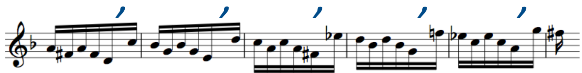
Figure 14. Transcription of bars 89-94, showing Podger's process in creating an 'upbeat'.

Finally, Podger takes a far less extreme tempo for her Presto , but does indulge in a similarly frequent rubato to Zehetmair. However, the manner of her rubato is surprisingly closer to that of Heifetz: she too chooses certain notes (often the first note in a bar) to hold in order to emphasise the start of a sequence or dramatic harmony. It is true that Podger actually uses this rhythmic alteration much more habitually than Heifetz does. Examples can be found straight away in bars 5 and 7, bars 12 and 13, and bars 17 – 24. Podger also sometimes creates an 'upbeat' by making space between the fifth and sixth sixteenth notes in a bar, shown below using commas.