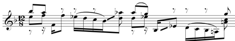
Figure 11. Siciliana , bar 11, showing Heifetz's portamento.