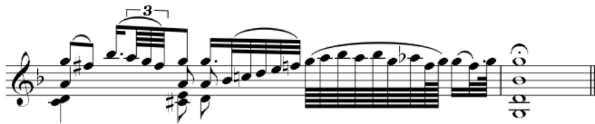
Figure 4 last two bars of Adagio, as written by Bach

Another decision to change Bach's original bowings occurs at the very end of the piece, where Heifetz makes unprecedented changes to Bach's long slurs of 32 nd notes: