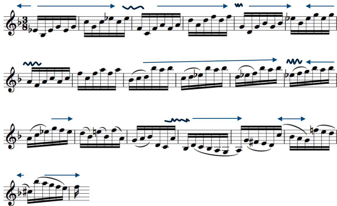
Figure 13. Transcription of bars 17-36, including arrows to show Zehetmair's rubato

this which make Zehetmair's Bach so controversial. I have chosen a passage which exhibits this tendency and drawn arrows to show Zehetmair's direction and tempo.