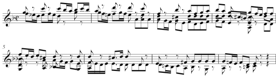
Figure 8. bars 19-26, Fuga

If a violinist wishes to maintain the integrity of polyphonic writing, s/he should played chords as far as possible without splitting them, so as to play as close as possible to what is written in print and show the interactions between the voices in ‘true’ time. Leopold Mozart wrote in 1787 that ‘there are, furthermore, some other passages, where three notes are written one above the other, which must be taken in one stroke, at the same time, together’. 29