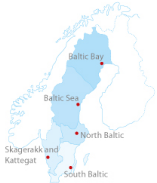
Figure 2: RBDs in Sweden (from Vattenmyndigheterna.se)

The districts are further divided into 119 main river basins and 24,460 individual water bodies. Several of the river basins are transboundary, shared with Finland and/or Norway, thus forming international river basins.