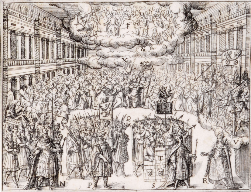
Figure 5. Greuter's third image, showing Acts 3–5. N) France, offering to Ignatius the River Seine (letter O, represented by the river god Neptune); P) Japan with its squadron, offering Francis a crown from their land (letter Q) and palm fronds, in memory of the "great number of martyrs of this new Church"; R) Italy, offering Francis flowers and herbs; S) China, bringing him cloths of silk; T) the Chinese warriors create with their shields an image—near-circular—of the Great Wall that protects their realm from that of the Tartars; V) the Italian warriors create with their shields an image of the leaping flames indicating the heavenly protection—stronger than China's Great Wall—that they receive from Ignatius along the road to Heaven; X) Rome and its provinces arrive with flames to set the temple afire. The portion of the image marked "&" [i.e., ampersand] shows the conflagration, which is followed by an earthquake. The portion marked with a Christian cross shows Heaven opening; the two saints are seen offering their protection to the Holy Church and to its "great Shepherd," Pope Gregory XV. After which, "Heaven closes, and all ends with festive song." (There is neither U nor W.)