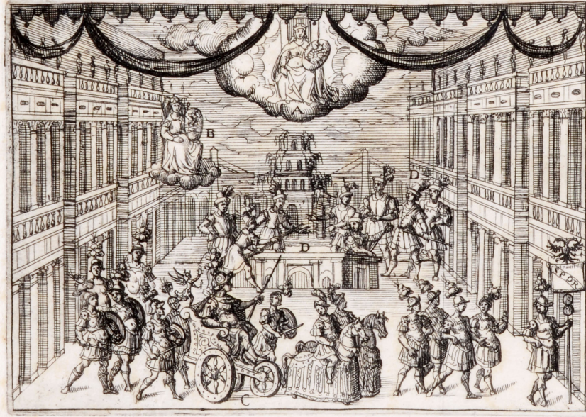
Figure 3. Greuter's first image, showing the prologue and the beginning of Act 1. A) Wisdom, enthroned on a cloud, before descending to the stage to speak the prologue; B) Wisdom departing on another cloud at the end of the Prologue; C) Rome arriving in a chariot pulled by white horses and accompanied by sixteen Roman youths and the "noble architect Metagenes"; and D) the nearly instantaneous building of a temple such as the ancient Romans dedicated to their "false gods."