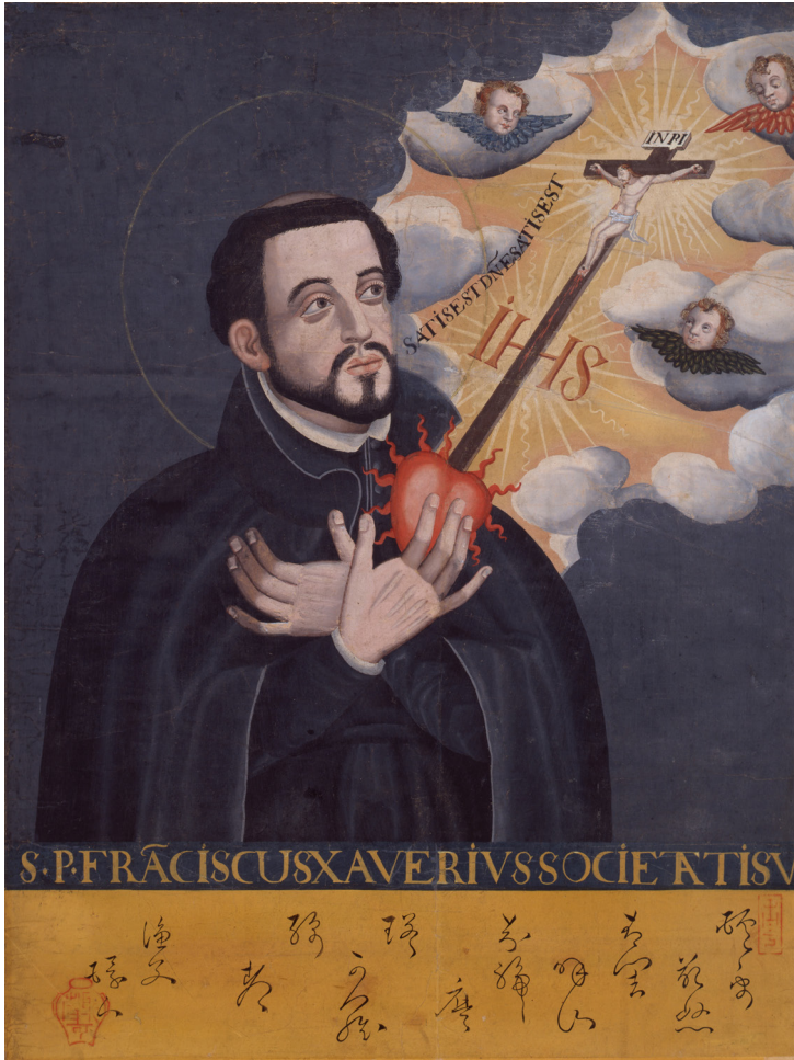
Figure 1. Devotional image of Saint Francis Xavier, with a caption in Japanese. Located in the Kobe City Museum, Japan. Francis is “speaking” his motto, “Satis est, D[omi]ne, satis est” (It is enough, Lord, it is enough). According to the online guidebook of the Kobe City Museum, this object is “presumed to have been painted by a Japanese painter trained in Western painting techniques. Made as a hanging scroll to be used as an object of worship.” The Japanese characters may be roughly translated as “Saint Francis Sacrament [of Penance]” (according to Saburo, “Kobe”). Image reproduced from Wikicommons.