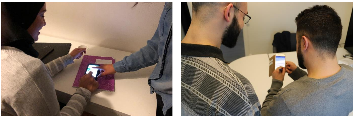
Communicative activity fig 3

Students use their smartphones and their applications for communicative activities (Fig-3-). Student 8 stated that he used smartphone applications not to simply translate but to “ communicate with other colleagues and the teacher with no hesitation. ” In other words, translation is not an end in itself. Students translate words, phrases, and sentences to establish communication. Moreover, student 7 noted, “ Using mobile apps helped me to socialize more with my colleagues. ” In the class observation, two students, one from Turkey and the other from Syria, were having a chat before the beginning of the class. They used Google Translate to help them better communicate in Turkish to Arabic. In fact, they communicated to discuss a class issue. The Syrian student said, “ because I do not speak Turkish and he [his friend from Turkey] does not speak Arabic and we want to communicate about something important related to the class so we used to google translation. ” Student 3 noted “ I was having an appointment at the employment office and I wanted to leave early so I looked at Google Translate to see how can I say this in Swedish and I memorize it and then ask the teacher for permission to leave early. ”