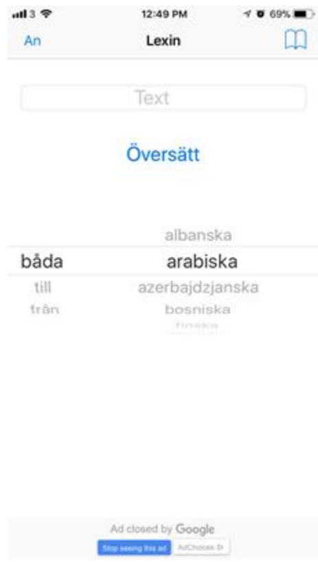
Mobile translation Apps fig 1

These applications are used, as some students stated, to “ translate individual words or sentences and even a whole text. ” In many language-learning tasks such as reading and writing, students come across new vocabulary words, without knowing the meanings of those unfamiliar words, they would not be able to complete the tasks. This indeed makes translation an indispensable language activity with which students are engaged in almost every single class. In a class observation, the teacher asked students to read a text for later discussions, where one student forgot his smartphone at home. The student asked a classmate, “Excuse me, I forgot my phone at home, can you look for this word in your phone?” This is to say; the student might not have been able to participate in the class discussions if he had had not used a translation application on the smartphone.