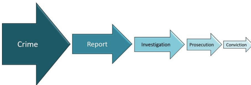
Figure 1 Non-proportional illustration of the different stages between which attrition can occur

Regarding the different stages, various factors may influence attrition, such as the victim’s perception and attitudes, lack of resources, and factors relating to observers and professionals in the justice system (Grubb & Turner, 2012). For example, victims’ trust in the system and the perceived probability that the case will lead to a conviction may influence their decision on whether or not to report (Chapleau, Oswald, & Russell, 2008). Confronting blaming attitudes in the justice system may lead victims to drop their charges (Campbell & Raja, 2005), professionals’ stereotypes concerning rape may lead them to doubt particular accusations (see Parratt & Pina, 2017, for a review), and lack of police resources may lead to rape cases being deprioritized in favor of murder cases, leading to insufficient rape investigations and dropped charges (see, e.g., Sveriges Radio, 2017).