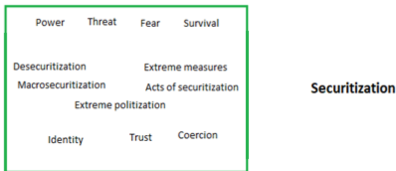
Fig. 3 The building blocks of Securitization

A graphical representation of the of the attributes of Securitization is presented in Figure 3.