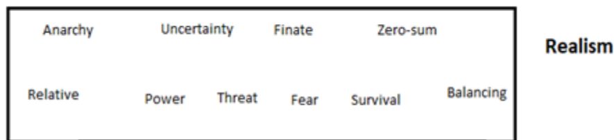
Fig. 1 The building blocks of Realism

The basic characteristics of this theoretical school are presented in a succinct manner in Fig. 1.