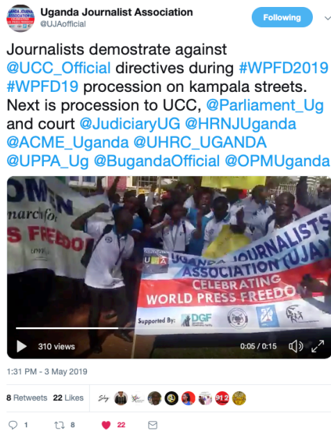
Figure 8: Demonstration on World Press Freedom Day 2019.

A re-vitalised UJA took the lead and appealed against the UCC order to the High Court. UJA is the oldest national journalist organisation in Uganda but it has earlier been accused of being compromised by the government and for having weak leadership. On May 23 the High Court halted the UCC order with address to the human rights enshrined in the Constitution. The judge said: “I am mindful of UCC regulatory mandate and national security at large, but this does not mean that the rights of citizens have to be violated” (Kigongo 2019). The final verdict is yet to come. Therefore the outcome is regarded as mixed.