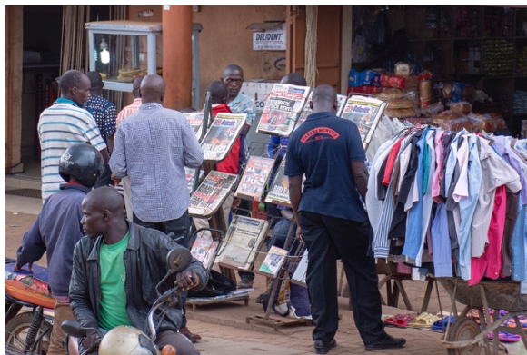
Figure 1: Ugandans reading front pages at a newsstand in Kampala, Uganda.

The largest media owner in Uganda is the state. The government-controlled Vision Group runs several national and regional newspapers (including The New Vision , Bukedde and Kampala Sun ), TV stations and radio stations. The biggest independent newspaper, the Daily Monitor , was founded in 1992 by journalists that wanted to create a free and critical daily newspaper. It is now owned by Nation Media Group with headquarters in Nairobi, Kenya. Nation Media Group also owns the weekly East African , NTV Uganda , Spark TV and a few radio stations. Other national independent media outlets include the tabloid Red Pepper , weekly The Observer , the magazine The Independent , NBS TV and the non-profit news agency Uganda Radio Network . The most vibrant sector is radio stations. There are about 200-300 radio stations around the country. Many are owned by politicians close to the ruling NRM, others are private businesses or community radios. The owners are organised in Uganda Media Owners Association (UMOA) and the National Association of Broadcasters (NAB). The latter often takes action to defend media when UCC order closures, bans or suspensions.