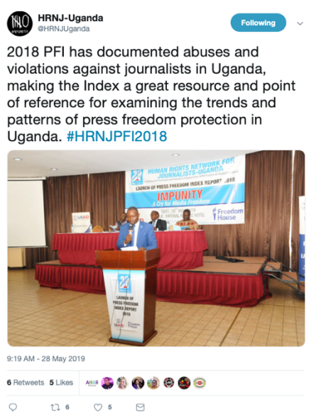
Figure 2: HRNJ-Uganda is reporting from the launch of “Press Freedom Index 2018: Impunity – A Cry for Press Freedom”.

The fight to end impunity is also a priority for transnational organisations as CPJ, RSF and IFEX, and the UN has declared 2 November the International Day to End Impunity for Crimes against Journalists. The campaign to end impunity is thus part of a larger global campaign. Information and material are shared globally. Figure 2 is from HRNJ-Uganda’s Twitter account. It shows the presentation of the Press Freedom Index 2018 which has the title Impunity – A Cry for Freedom . It also shows that HRNJ-Uganda has borrowed a campaign icon from IFEX as their profile picture on Twitter.