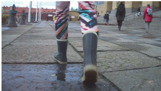
On day two we all participated in a workshop on walking as artistic method, led by Monica Sand.