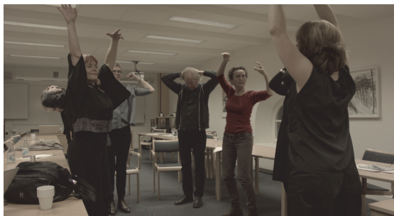
The participants discussed ideas, shared knowledge and experiences, in the flow of free speech and corporeal expression.