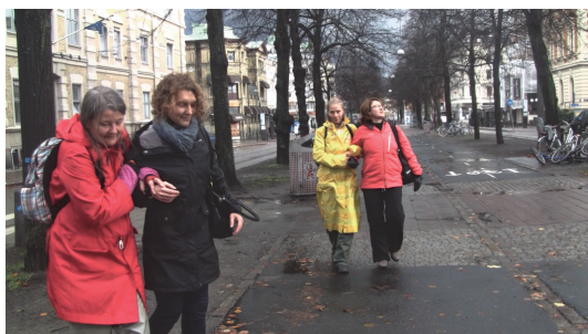
Blind walking at Vasagatan. The aim was to corporeally resonate with the city, and thus practically and theoretically create places to think.