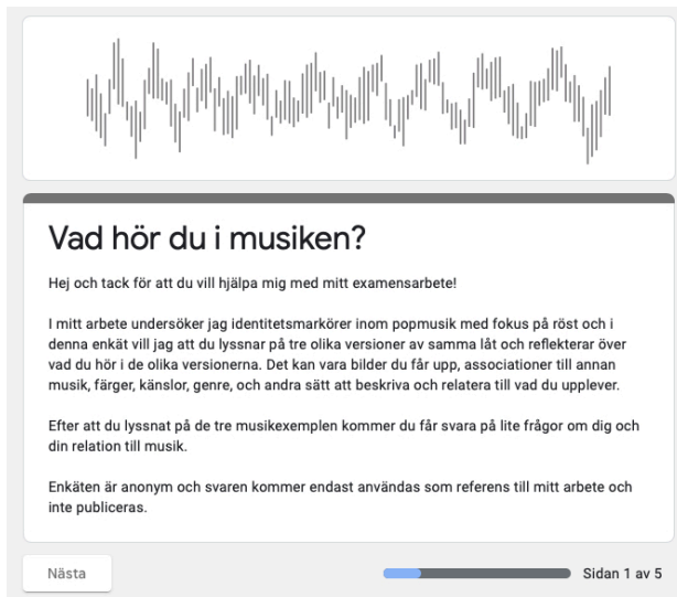
Figur 1. Formulär sida 1, beskrivning av enkät.