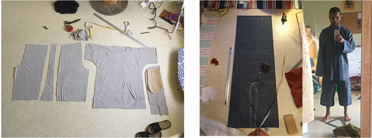
Fig.8, Left to right: Linnen tricot set , Original blue cotton/hemp set

The black jacket and the blue set (Fig.9) are significantly important steps in initiating my master thesis. The original blue set was made as a shirt and short trouser in the beginning of the third semester and the black jacket came into existence a few weeks later.