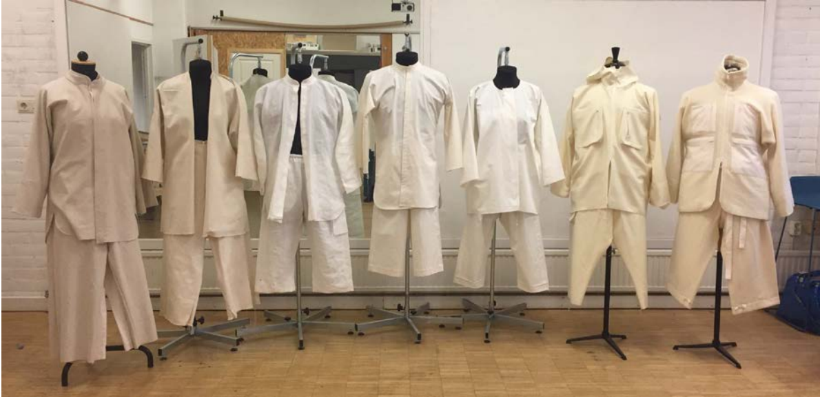
Fig.23, Sets in the making on dress stands. From left to right: heavy silk noile, heavy cotton fishbone set, eko hemp set, regular cotton set, cotton twill set, wool twill set, monk wool fleece set.