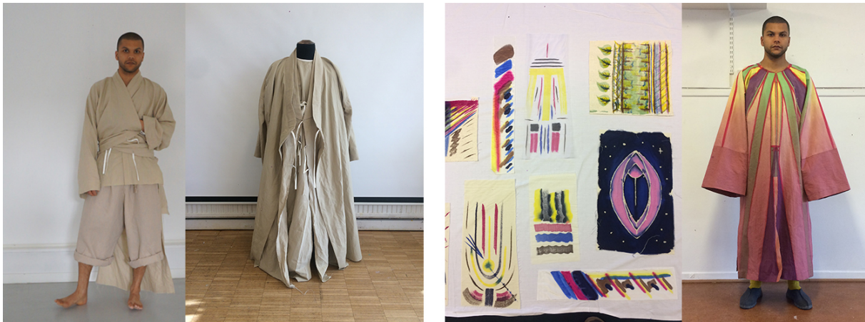
Fig.7, left to right: Garments in greyish linen fabric, early experiments with colour

I spent most of my time in this master's education exploring various textile craft methods focusing on colouring fabric, painting and dyeing textiles. I also explored a bit of weaving. There have been some satisfactory outcomes but for a big part I been feeling un-content, aimless and restless. But at the end of the second semester, before summer break I felt a need to just cut and sew. I bought lots of greyish linen material and decided to just make loads of clothes to test, try and feel (fig.7). I just freebased and focused on having fun. This was the gateway for me getting back into making garments.