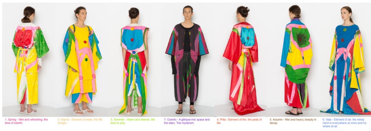
Fig.4, Sacred coloration .

This work is done within an institution, same as Landahl (2015), that encourages and expects students to find new expressions and methods in fashion design in order to push the field forward in such a way.