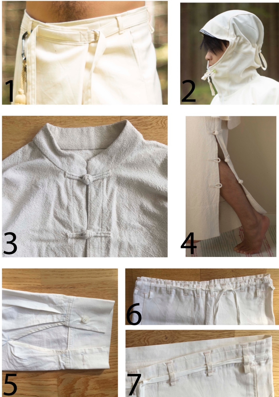
Fig.26, 1: waist on Wool twill trousers. 2: Hood with adjustable strings on Wool twill jacket. 3: Heavy silk noile shirt with handmade Chinese frog buttons. 4: Slit on Heavy silk noile trousers. 5: Cuff with button and pleated sleeve on Regular cotton shirt. 6: Waist on Eko cotton hemp trouser. 7: Waist on Regular cotton trouser.

Most of the sets have slightly different finishing and trims. In Fig.26 some of my favourite details are displayed.