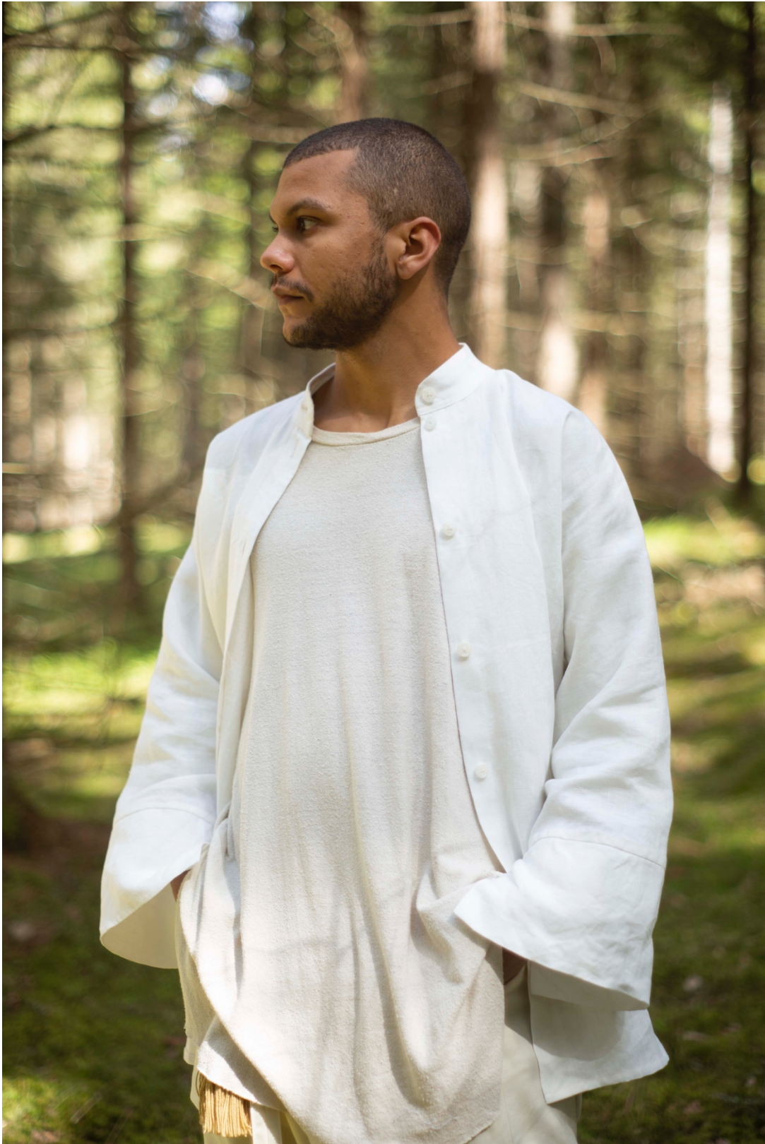
Fig 39, Me in eko hemp shirt and silk noile tricot shirt