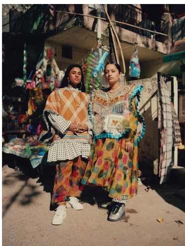
Mriga & Amrit

GOOPi is a Taiwan based platform and online shop that seeks to strengthen the connection between people and nature by focusing on providing high quality urban outdoor Yama style clothing (Goopi, 2019). They are dedicated to thoughtful design and value quality fabrics and functionality. They also have their own brand GOOPiMADE. I enjoy the oversized style and how they merge traditional Asian styles with functional aesthetics and technical fabrics (fig.6).