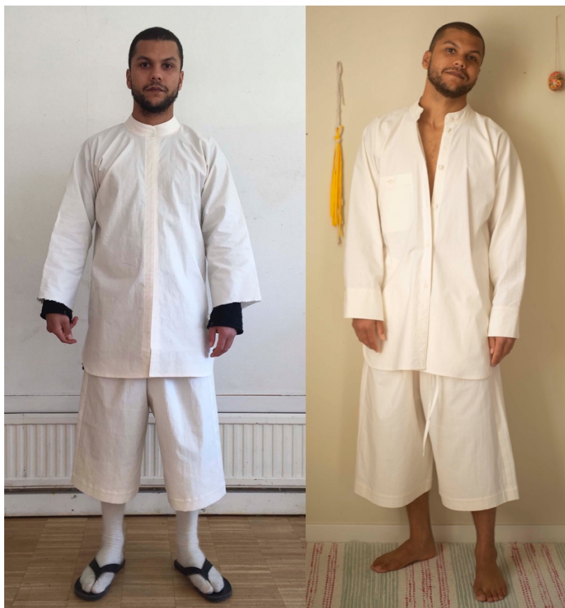
Fig.21, Regular cotton set. Left: In the making. Right: Finalized

Since I sold a pair of the shorts referred to as the skirt trousers by the customer and that the original model, the brown cotton shorts was an appreciated companion on Bali I thought that it would be nice to make a set inspired by them. I decided to use a regular cotton weave. The regular cotton weave is commonly used for batiks in hot climates. My buba and Sokoto (fig.5) is made from this material as well as many of the Indonesian batiks I found on Bali. The same goes for the brown cotton shorts (fig.13) made from a Tanzanian batik fabric.