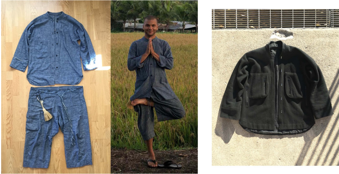
Fig.9, left to right: Blue set, Black jacket