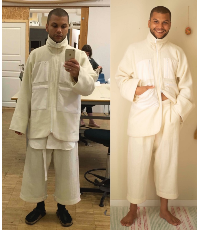
Fig 10, Monk wool fleece set. Left: In the making. Right: Finalized

The outer material is a heavy wool called monk wool, due to its roughness I decided to have a sort of lining inside it. The lining material is a thin and fragile wool voile. The mix of the two wool materials give a nice feel to the material as a whole, but the voile was really difficult to work with. I also spent a whole day figuring out how to do the bottom hem of the jacket. All in all, this first set took an unproportionate amount of time to make. It is a cool and beautiful garment, but it lacked context and I struggled with how I could address it the value it is actually deserving of.