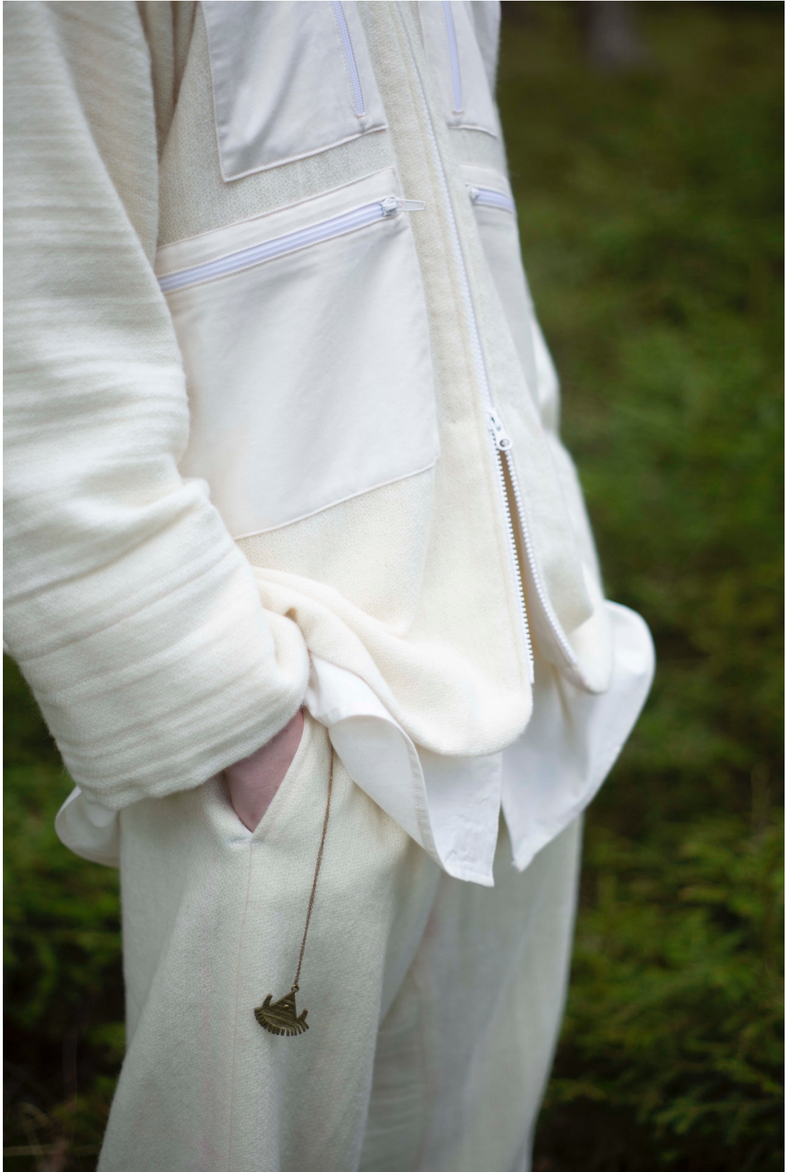
Fig 44, Isak in monk wool fleece set and regular cotton shirt