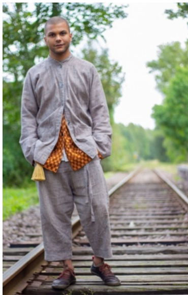
Fig.1, outfit from the wardrobe project

Sometimes I make plans but often I do not stick to them and are influenced by the process of making itself to explore thoughts that occur during making. Over the years of making my own clothes I have discovered several aspects of making and wearing. Among them I discovered an interest in sets and a love for simple and spacious cutting. I don't exactly know why but it intrigues me to make sets. A set is a top and a bottom garment from the same cloth (fig 1-3).