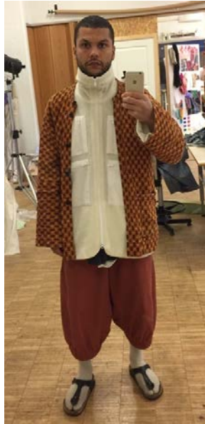
Fig 11, Monk wool fleece jacket with working shirt as outer layer

I thought why not make an outer shirt for the monk wool fleece jacket in the same material I had chosen for its pockets and part of its lining. To be true to my decisions of making sets I made a pair of trousers as well as a shirt.