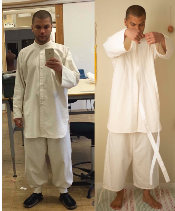
Fig 12, Cotton satin set. Left: In the making. Right: Finalized

I thought why not make an outer shirt for the monk wool fleece jacket in the same material I had chosen for its pockets and part of its lining. To be true to my decisions of making sets I made a pair of trousers as well as a shirt.