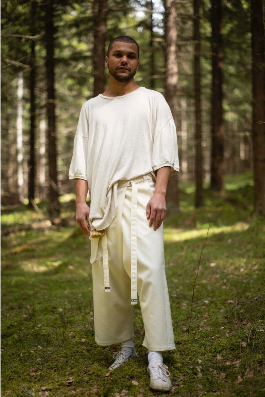
Fig 40, Me in wool twill trouser and silk noile tricot shirt