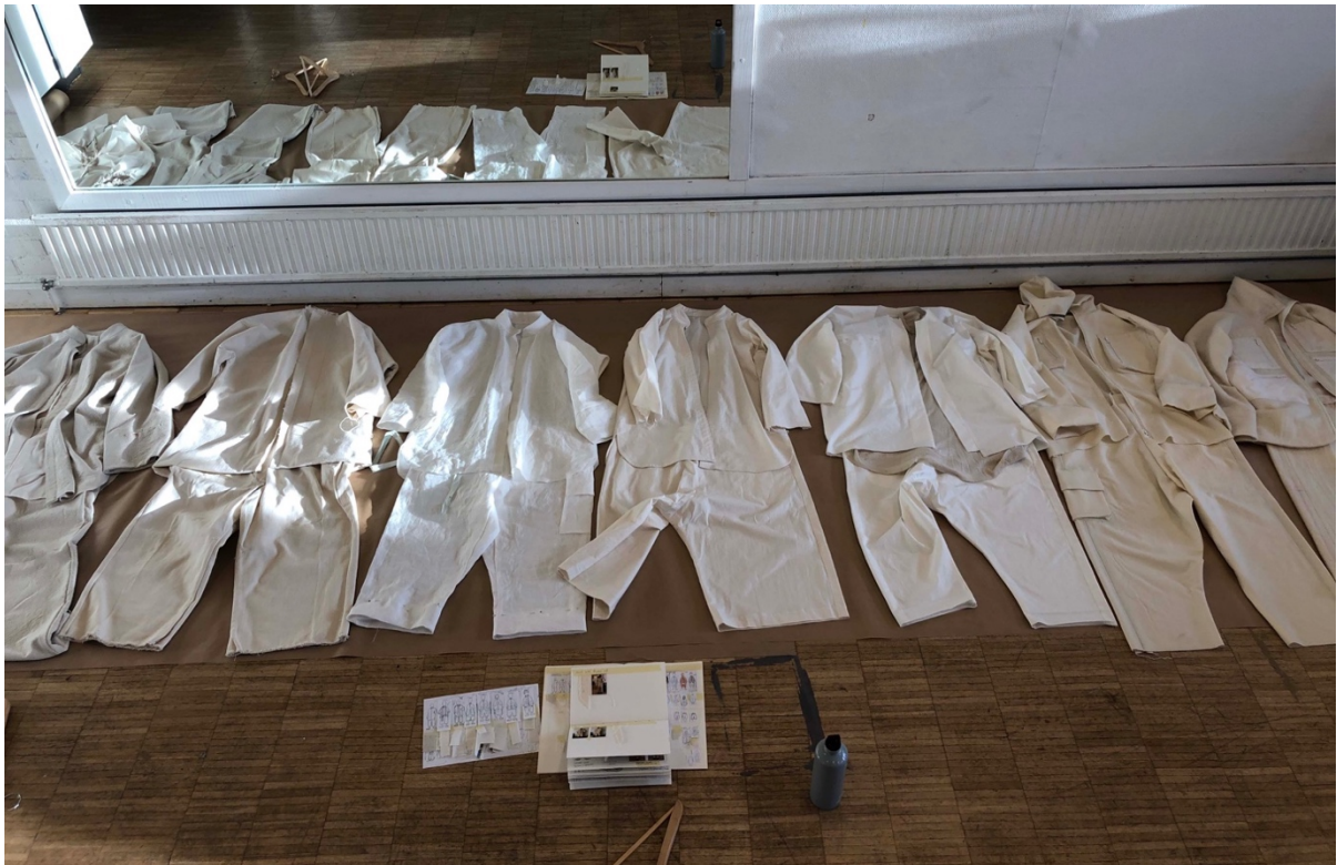
Fig.24, Sets in the making flat on the ground. From left to right: heavy silk noile, heavy cotton