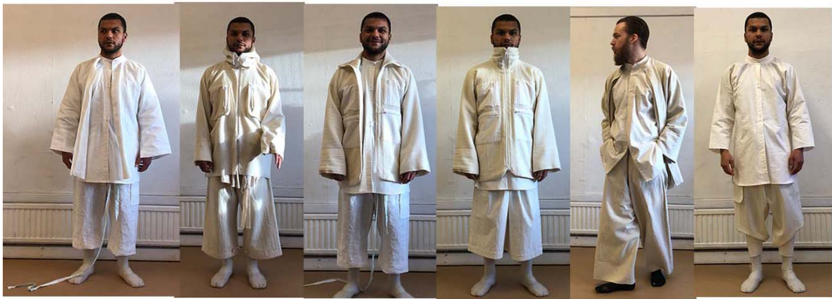
Fig.25, Intermixing garments from various sets

At this point I had eight white sets. Except for the first set, the Monk wool fleece set, none of the sets were finished in terms of hems, buttons, closings and other trims. I was proud to see them altogether, but it was even more fun to try them on and combine them and see that they actually work together as layers (Fig.25). However, at this point they still felt kind of rough and I realized how important detailing is.