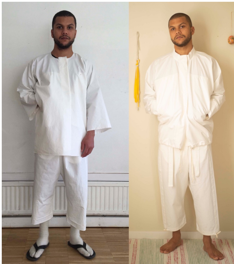
Fig.22, Cotton twill set. Left: In the making. Right: Finalized

I stumbled on the cotton twill fabric and was a bit hesitant to it at first, but due to the tight weaving of this fabric I thought it would make a good shell jacket. If the weaving is tight it is harder for water and wind to penetrate it. The material itself relates to the wool twill but is much tighter and made from a thinner yarn, which gives it a paper like feel.