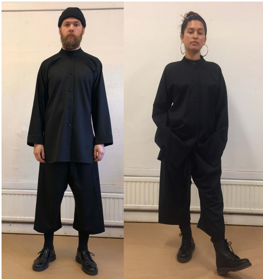
Fig.20, Black wool set, tall shirt and narrow trouser on two different bodies

I usually help my mom at fårfesten in Kil, which is a wool festival in the small town of Kil in Värmland in the middle of Sweden. For the 2020 edition I decided to make two sets for purchase. The set I made for this occasion is based on the sets for this project as an experiment to see how I could apply it in a commercial context. But instead of using white materials I used a shiny black wool material which has an exclusive look to it. I made two shirts in the same size except that one of them was a bit longer and two trousers where one was a bit longer and narrower and one a bit shorter and wider.