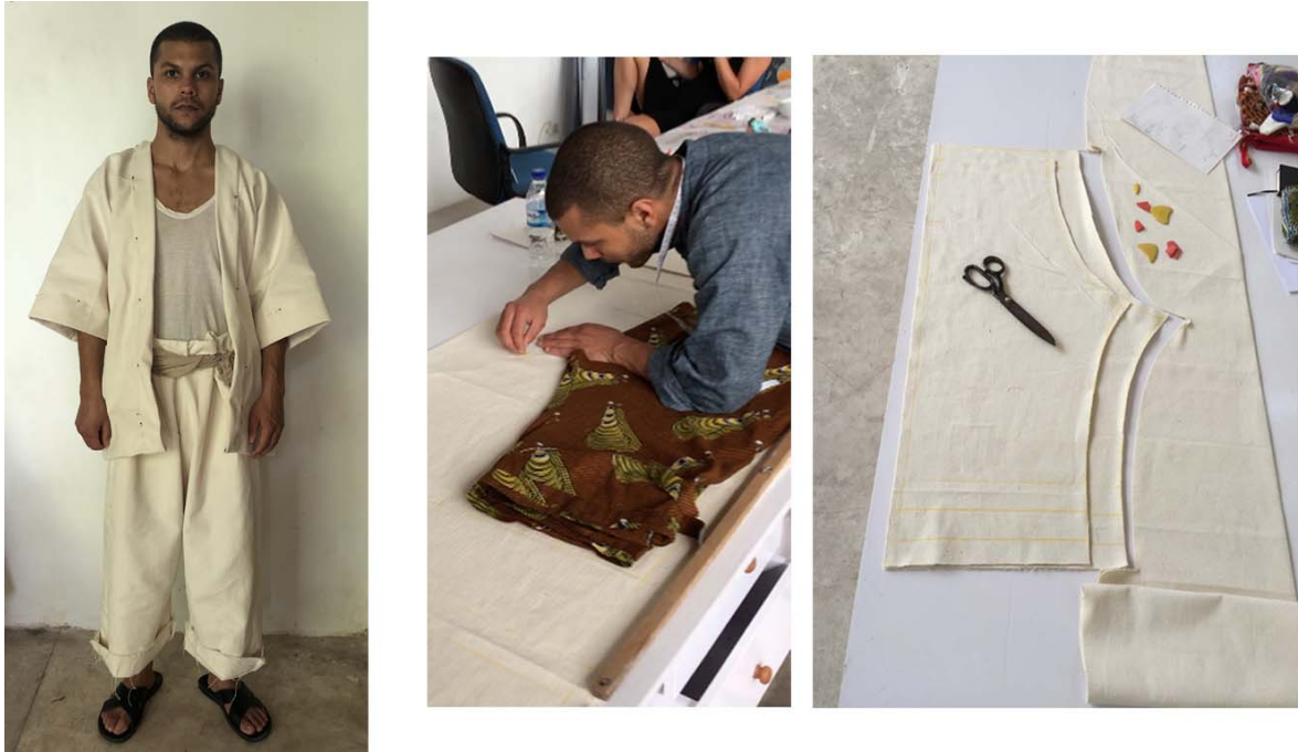
Fig 14, left side: heavy cotton fishbone set. Right side: process of cutting fishbone set trousers

I didn't fully finish this set with hems and closures or even a collar, but it was a liberating, I felt free due to the restrictions. The workers at the airbnb commented that the set is not for Bali climate. This set was not finalized in the end.