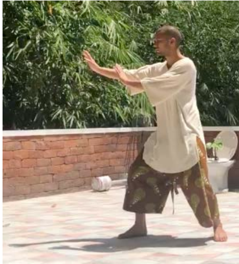
Fig 13, Brown bali shorts in cotton batik fabric from Tanzania and silk noile tricot t-shirt