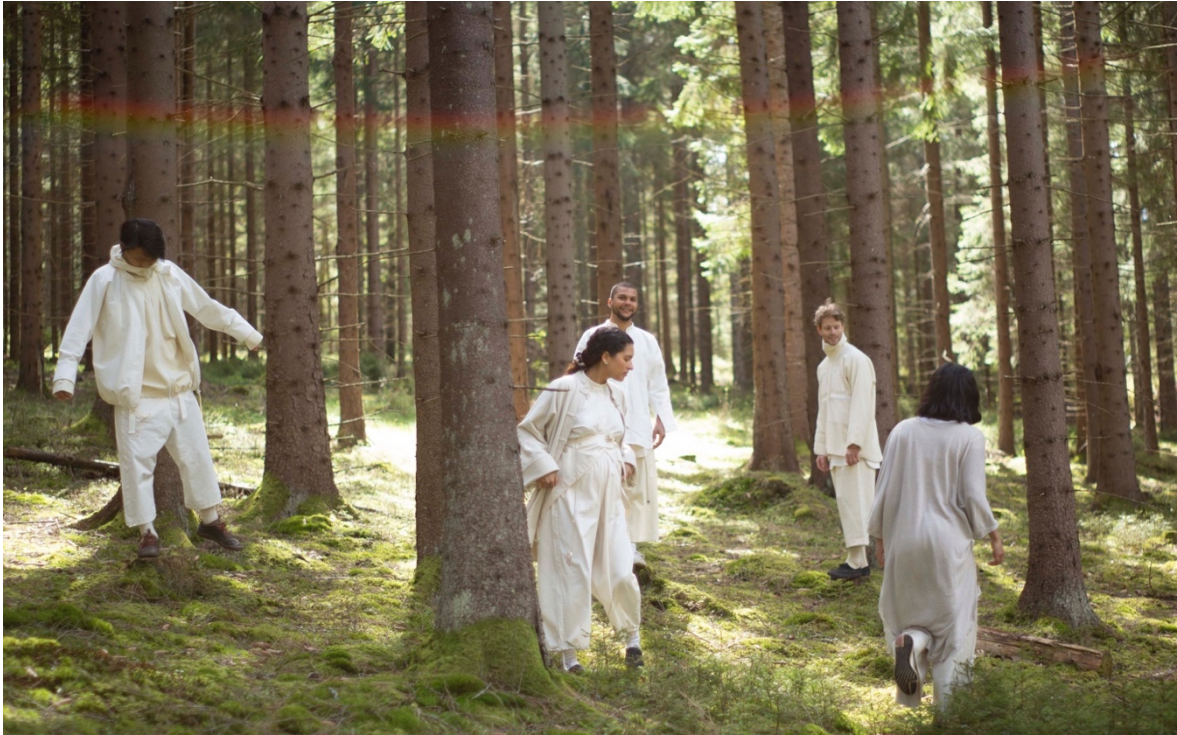
Fig.28, In the woods with the finished garments group photo by Ariadne Sandberg Karali