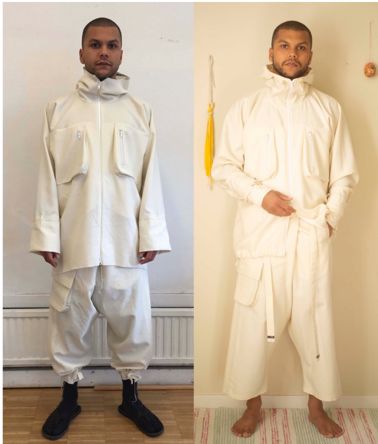
Fig.19, Wool twill set. Left: In the making. Right: Finalized

adjustable closings. Furthermore, the wool twill adds to the variety of material in the collection. It is the second wool material, but it has a totally different character than the monk wool fleece set (Fig.10) as the wool twill is much neater and softer. This set is also inspired by the Black jacket (Fig.9) as the pockets are similar. The black jacket is also made of wool, but a heavier one.