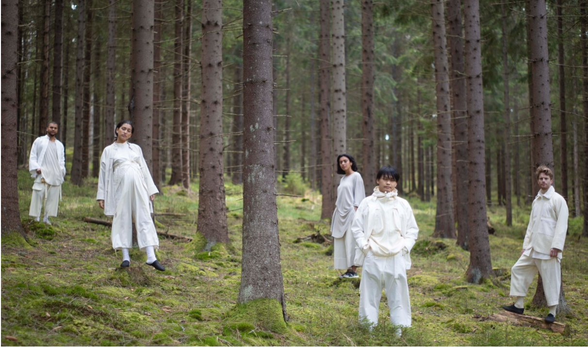
Fig 32, Group photo in the woods