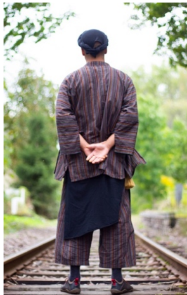
Fig.2, outfit from the wardrobe project