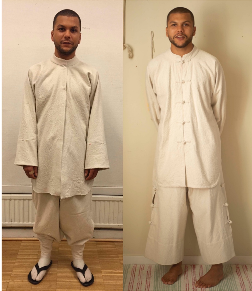
Fig.18, Heavy silk noile set. Left: In the making. Right: Finalized

I consider this a spring set due to its heavy quality. The trouser is straight and wide like the cotton satin set. Before it was finalized the idea was to have it tucked in at the ankles. But for the finalized trouser I decided to have a wide ending and a slit with buttoning on the sides. The buttons are classic Chinese frog buttons with loops which I knotted and hand stitched, similar to the Tangzhang jacket (Fig.5).