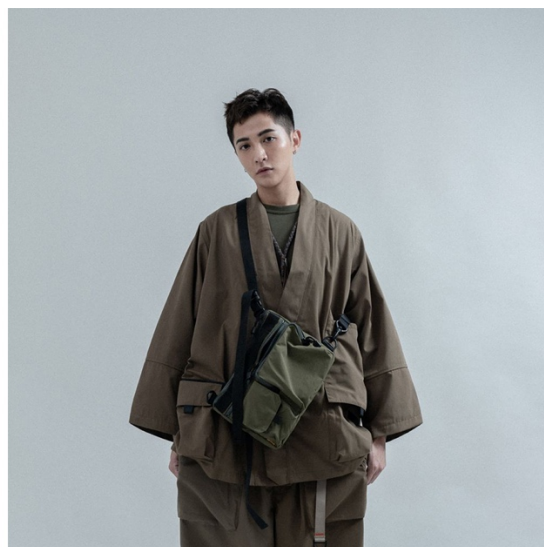
Fig.6, left to right: NorBlack NorWhite, GOOPiMADE

Personally, I enjoy loose fitted clothes like the GOOPiMADE jacket in fig.6 and the shirt worn by tai chi master Wu Tu Nan (fig.5). I believe it to free the body. I also think it is more comfortable, it allows for and encourage movement as it enables the body breath.