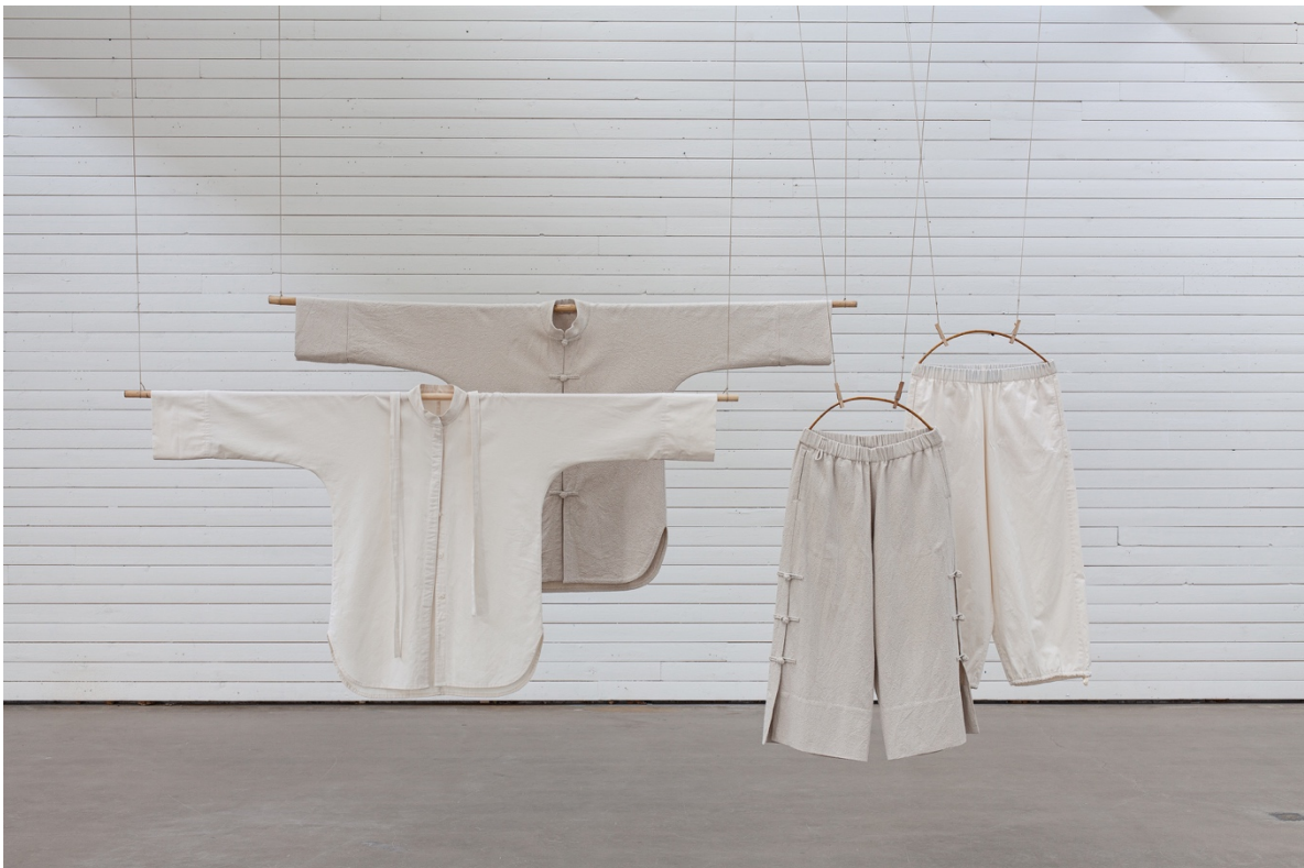
Fig.29, The collection hanged in a gallery space