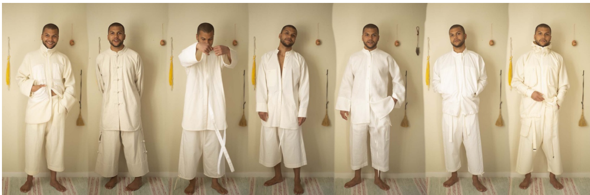
Fig.27, Overview line up of finished collection

When the collection was finally finished, I got to try all the garments on and really feel and see them for the first time. I documented each set on my own body (Fig.27). I also arranged a photoshoot in the woods with a few people (Fig.28) and it was a real reward to see the sets intermix with each other on different bodies and have other people trying them on and feeling them. I also hanged my clothes in an exhibition area, installing them as if they were to be exhibited in a gallery (Fig.29).