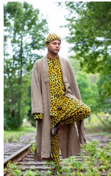
Fig.3, outfit from the wardrobe project