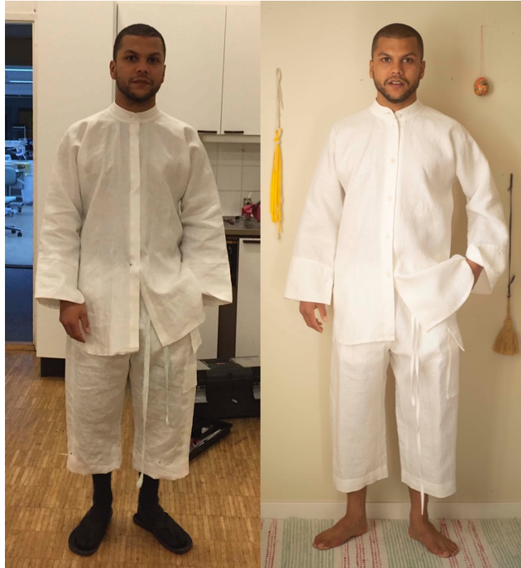
Fig.17, Eko hemp set. Left: In the making. Right: Finalized

In the final version the trouser have a side pocket and a string to tightening them in the waist and can be worn by different body sizes. The shirt has a straight collar, regular centre front buttoning and cuffs with a button.