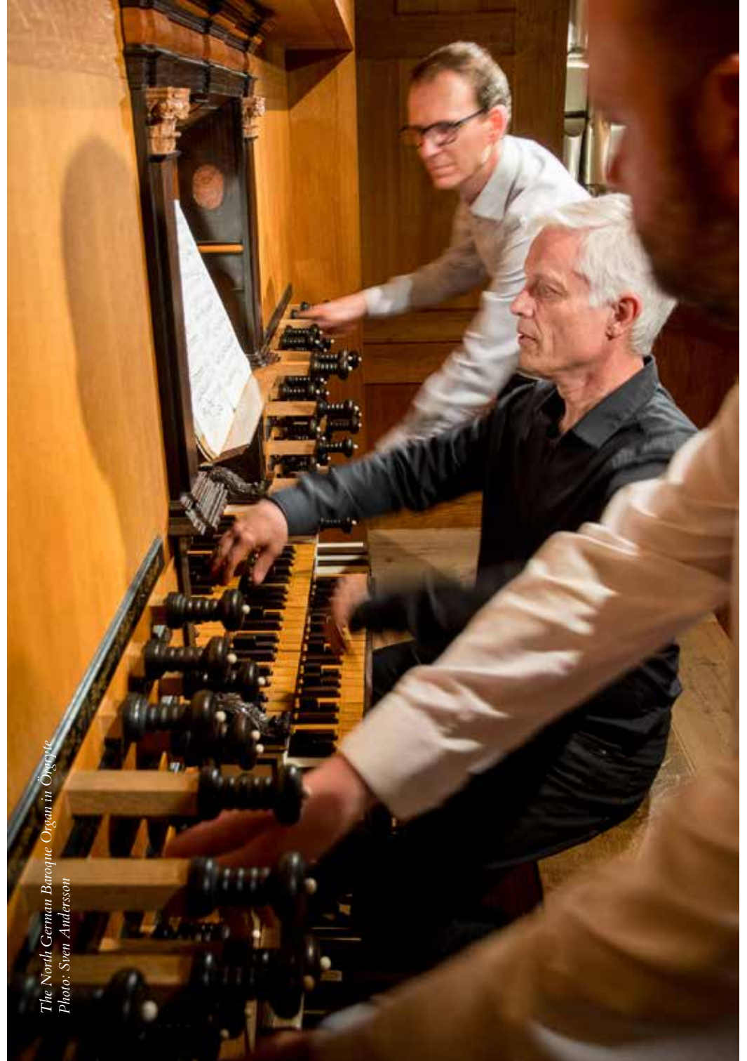
The North German Baroque Organ in Örgryte