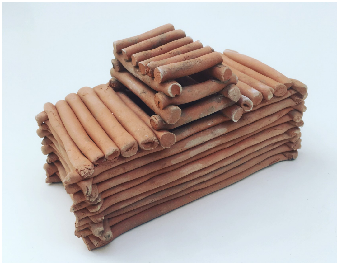
“Koja” (Hut). Earthenware. 5x15x10 cm