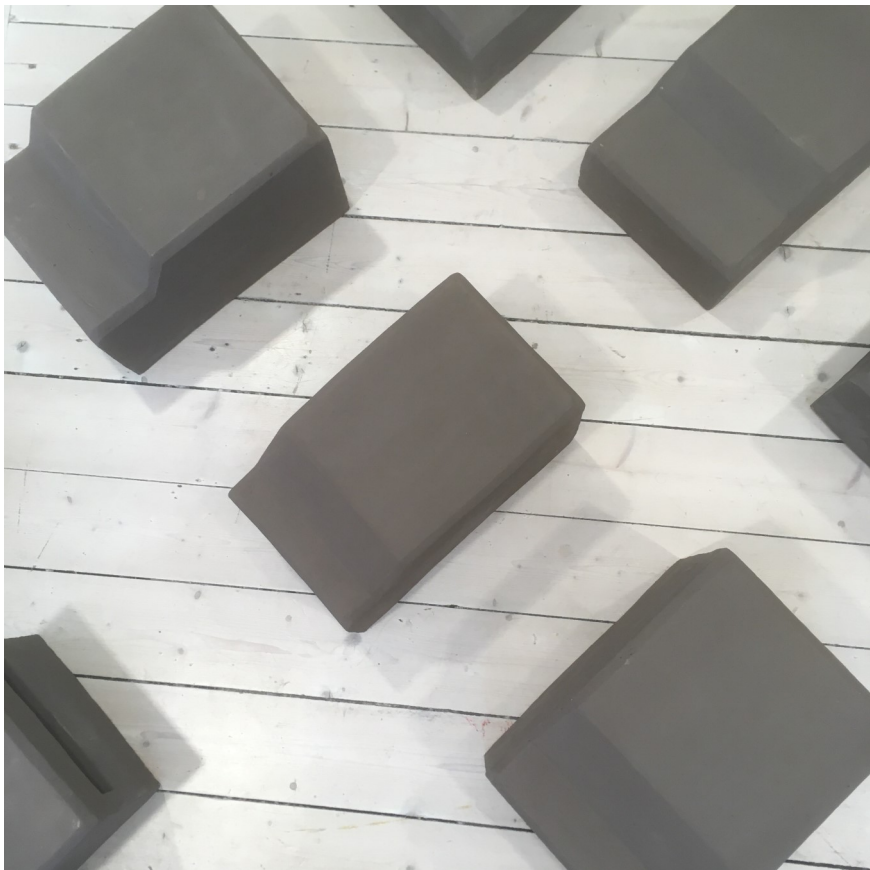
Suspicious minds. Earthenware, Various sizes.