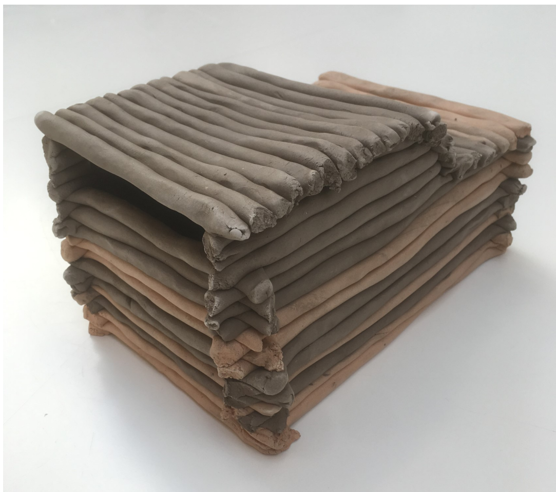
“Värn” (Fort). Earthenware, 35x15x20 cm.