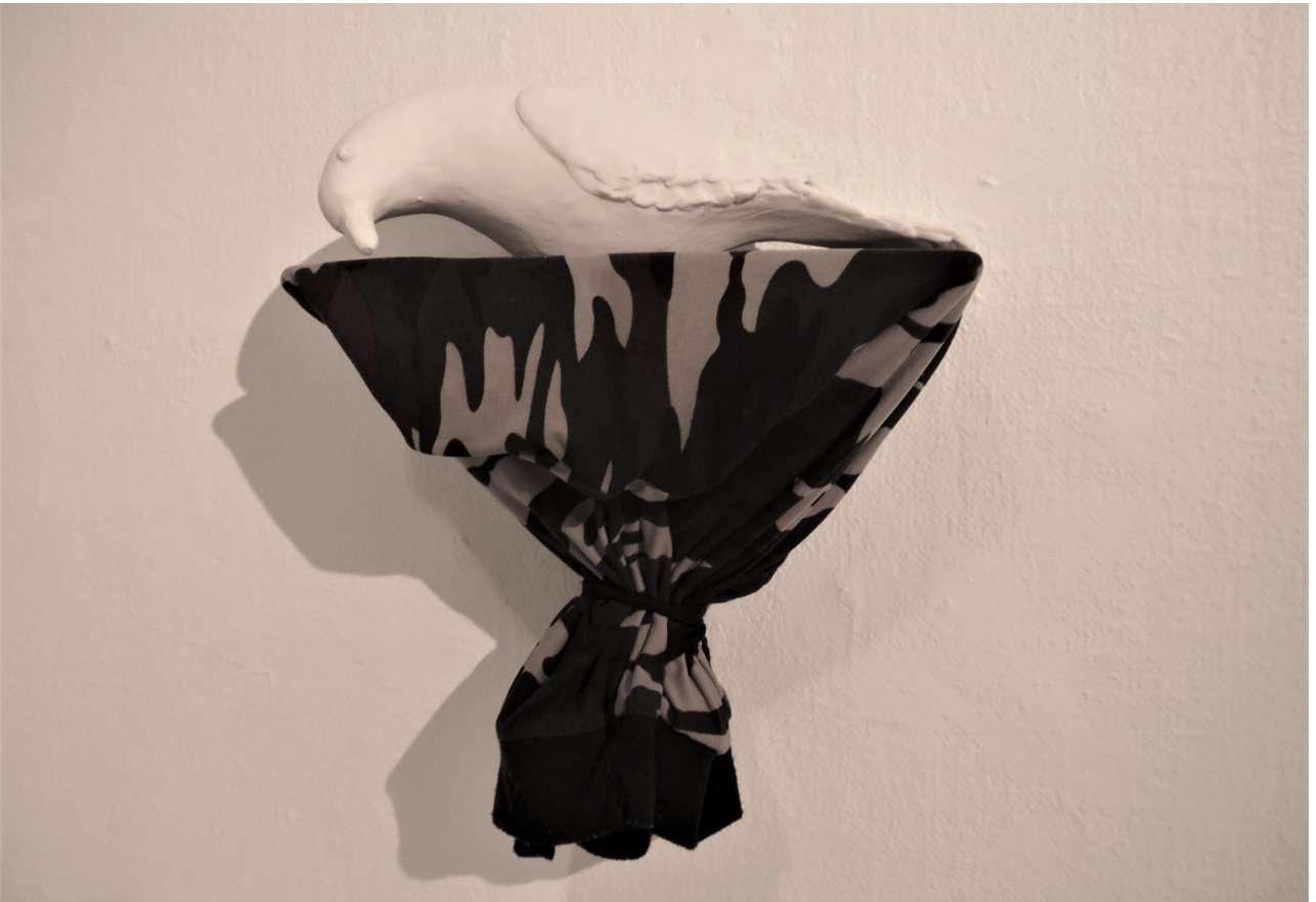
“Skänk mig vita fjädrar” (Present me with white feathers) Earthenware and textile. 30x40cm