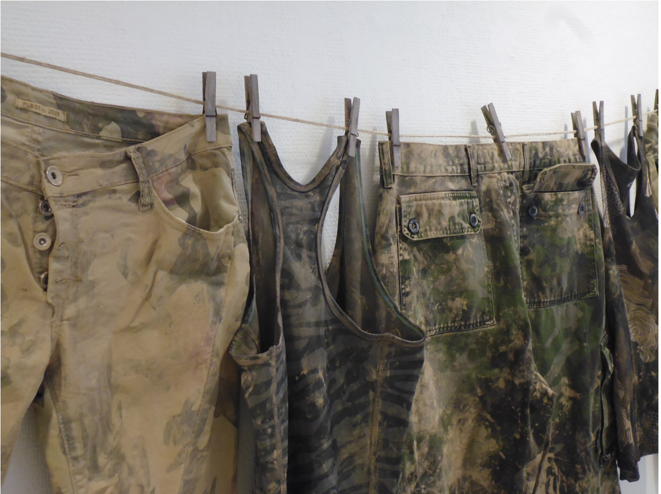
“Smutsig byk” (Dirty laundry), textile and raw clay. 250x120 cm (Detail)