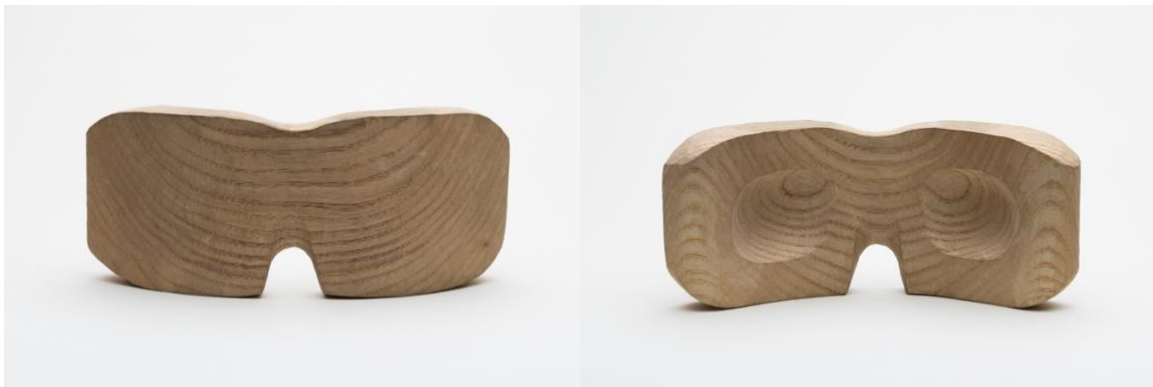
Ashwood Goggles by Tobias Birgeron