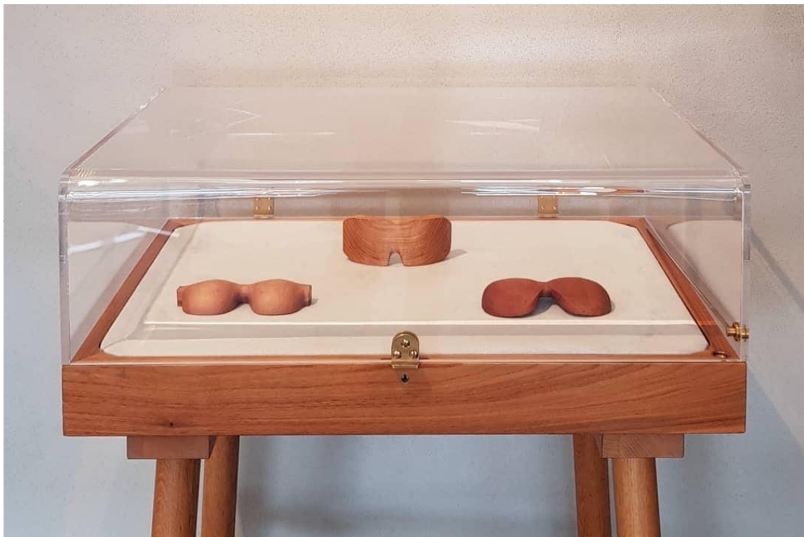
"See no evil" Triptych by Tobias Birgersson

We invited 29 artists to create works inspired by their personal experiences of the current Corona crisis. The result is QUARANTENA - an art exhibition forming a unique testament to these strange times we are all going through.